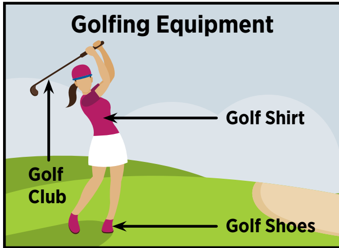
Illustration © iStock.com/MuchMami