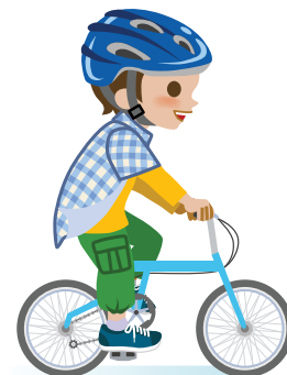
To be safe, this boy put his helmet on and made sure his shoes were tied before riding his bike.