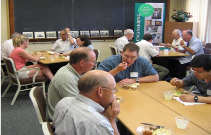
Everyone is enjoying the BAE Luncheon.

The Department of Biosystems and Agricultural Engineering hosted our alumni on June 9th as part of MSU's Kedzie Reunion, honoring MSU graduates of 50 years or more. For the last 75 years, the Kedzie Reunion has been one of MSU's most significant traditional celebrations. The alumni attended a luncheon, watched a presentation on what the department is currently working on and took a tour of the many changes in the building over the years.