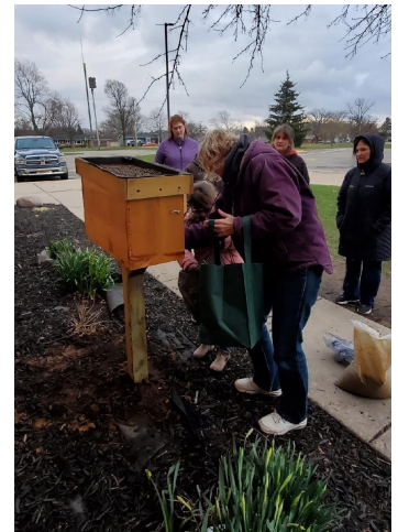
Started as a safe and engaging outdoor activity in early 2021 for 4-H clubs across the county, the 4-H Council finally completed their community service project creating Little Free Libraries to be installed around Calhoun County.

Coordinating youth activities at Crane Fest in Bellevue in October provided a nice opportunity to work other local organizations and to expose 213 participants to 4-H and a variety of outdoor education experiences. 4-H youth and adult volunteers engaged participants with the Hoover Ball, several livestock and outdoor activities and talked about their 4-H experiences with the young people who participated.