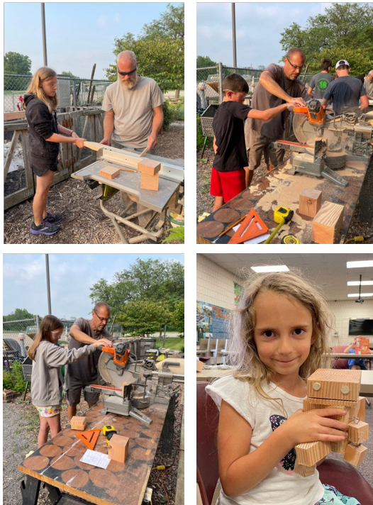
Hosted by the Macomb County 4-H Youth Council, 24 youths participated in a woodworking workshop.

The MSU Extension 4-H Youth Development vision for global and cultural education is having young people develop an understanding of themselves and other people; a sense of connection with, respect for and responsibility to the world; and an ability to serve and lead with wisdom, care and humility.