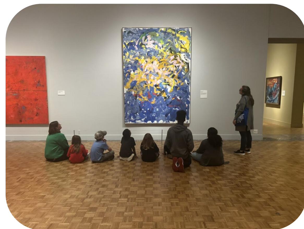
4-H Mental Health Awareness at the Detroit Institute of Arts

MSU Product Center fosters strong and successful community food-based businesses by providing one-on-one food business support with Innovation Counselors, processing authority review for shelf stable products, as well as other services, such as nutrition facts and analysis, business development, strategic planning, and marketing analytical insights.