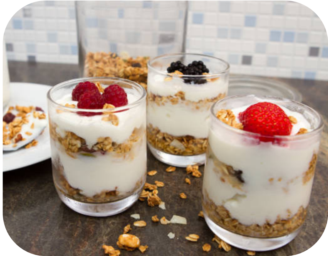
Participants in nutrition classes offered through MSU Extension make a variety of snacks, including fruit and yogurt parfaits