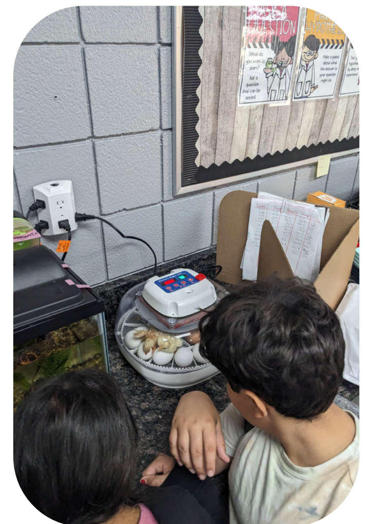
Afterschool 4-H Embryology SPIN Club at The Dearborn Academy