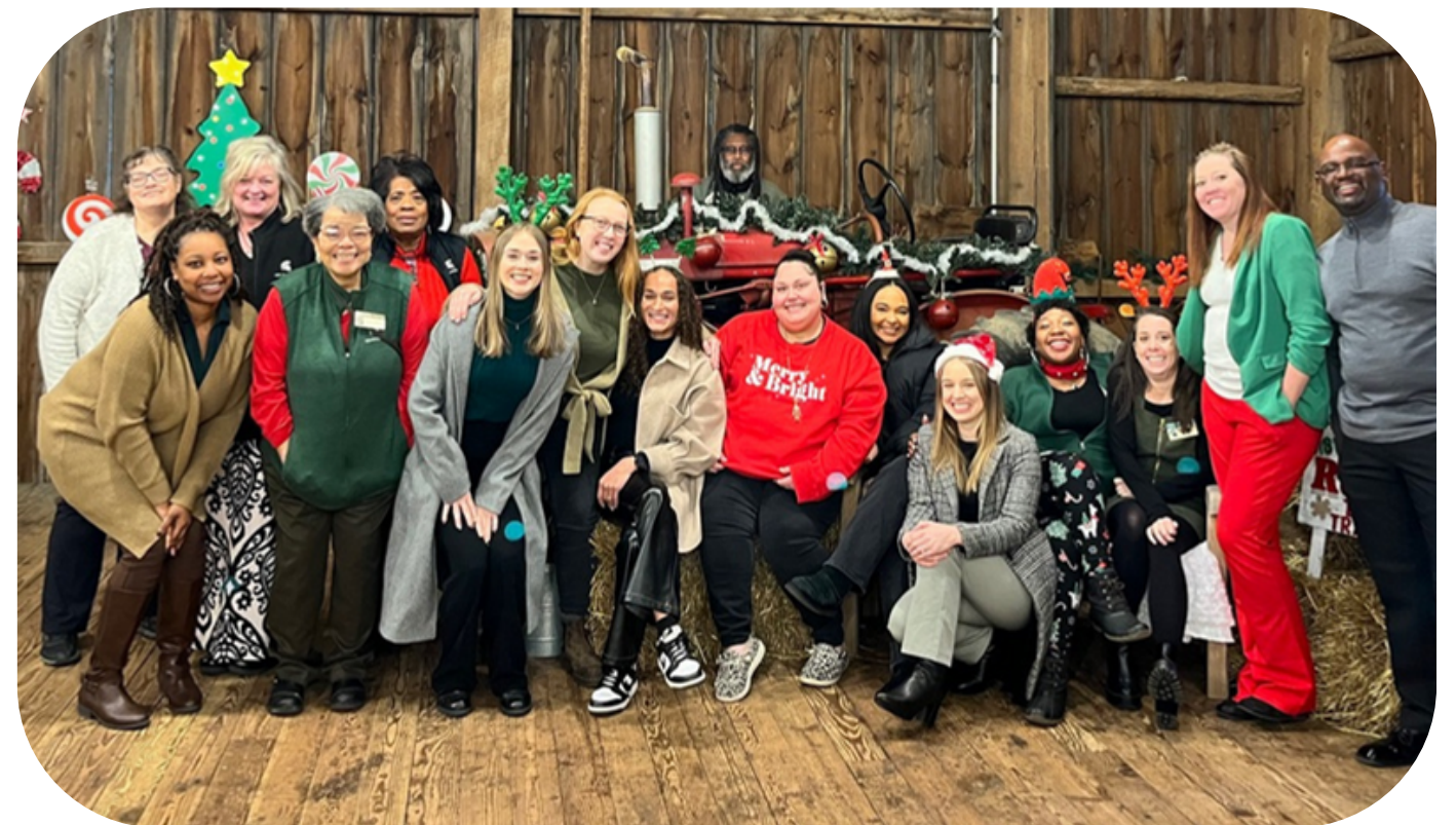
Wayne Extension Staff at Tollgate Farm