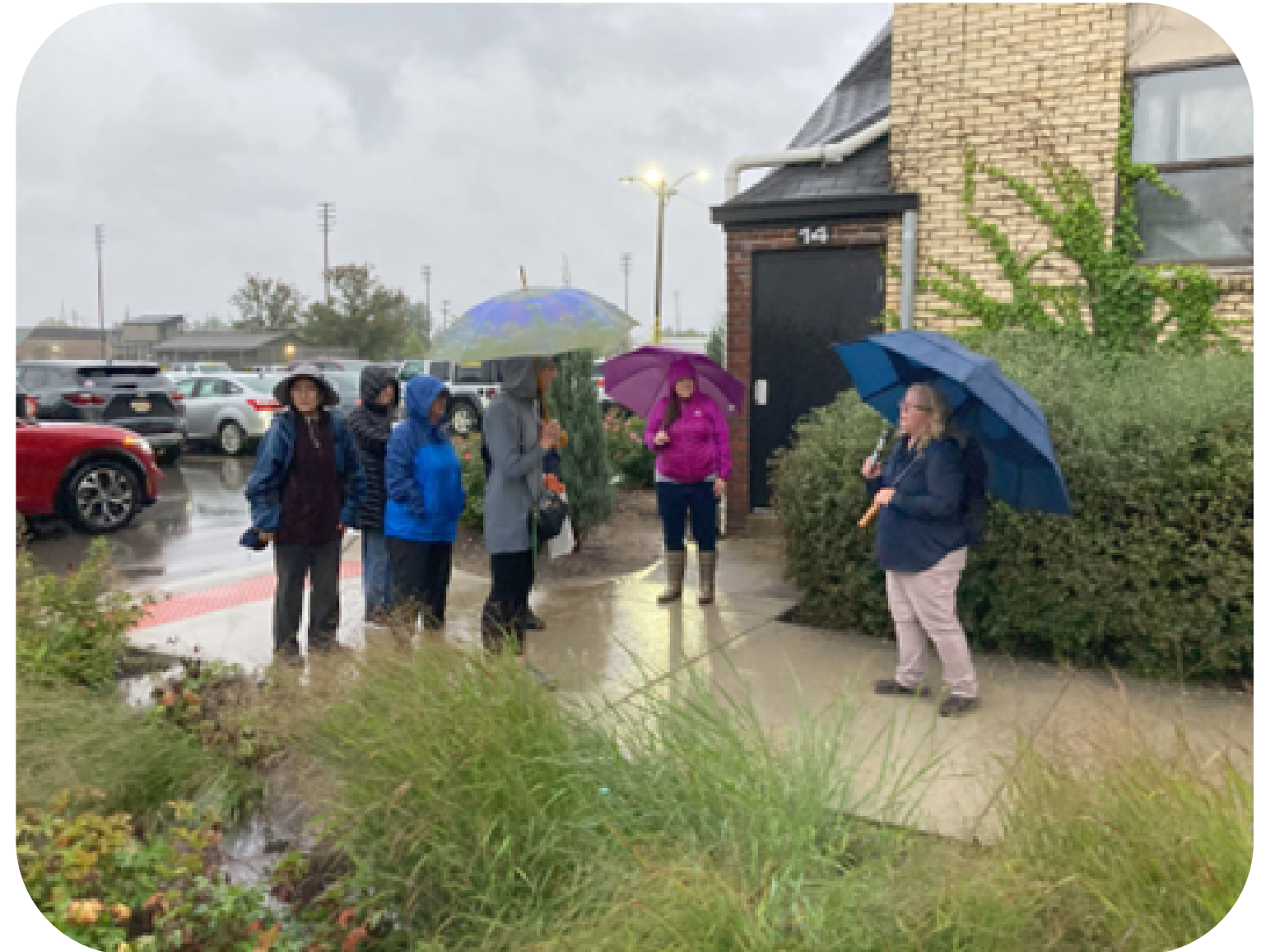
Wayne County Conservation Stewards class viewing rain gardens in use at the PARC in Plymouth

Michigan Sea Grant also offers many free online programs including an annual Fishery Workshop that highlights the status of fish populations in the Detroit River and Lake Erie, Birding 101 events in the spring and fall, and a planning and zoning email course for local officials.