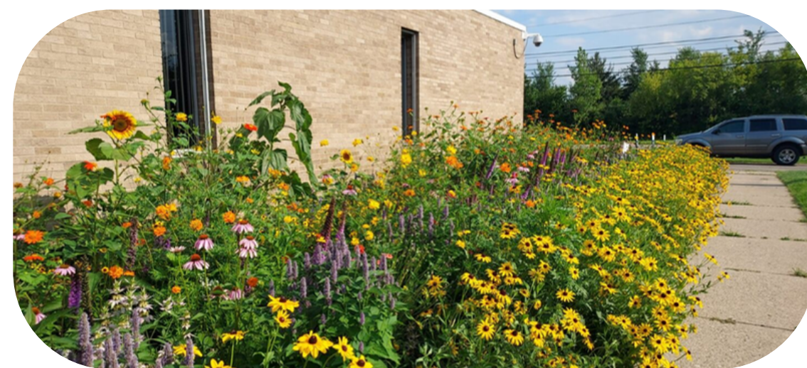
Master Gardeners Project at the Wayne County Department of Health, Human & Veterans Services in Wayne

Lawn & Garden Hotline: 1-888-678-3464 Ask Extension - https://ask2.extension.org/