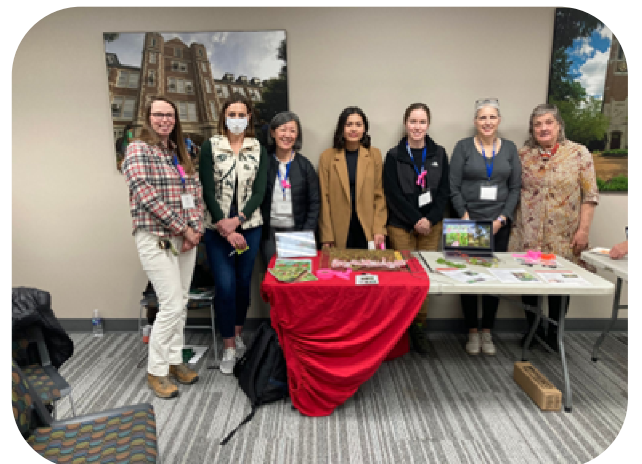
Wayne County Conservation Stewards presenting their capstone project at the MSU Detroit Center

Find out more about MSU Extension Sea Grant programs on our website: www.canr.msu.edu/michigan_sea_grant/