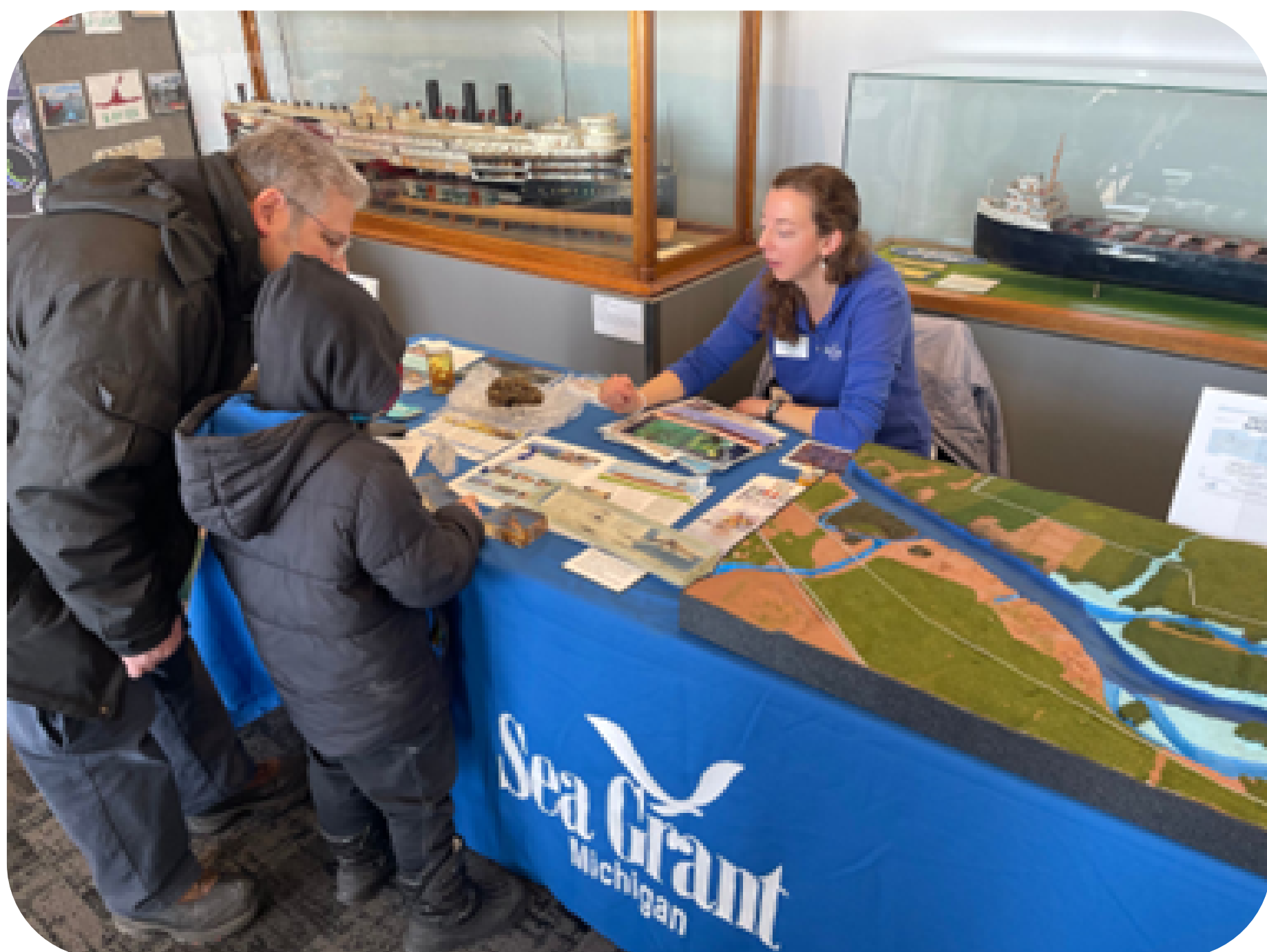
Answering questions at the Shiver on the River Eco Fair at the Great Lakes Dossin Museum in Detroit