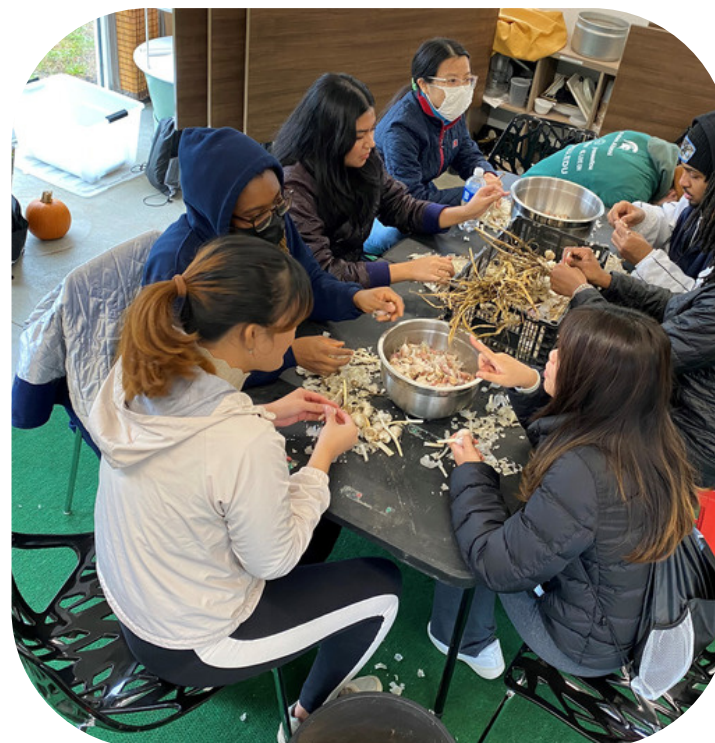
Undergraduates from MSU shell black eye peas during a volunteer day at the DPFLI