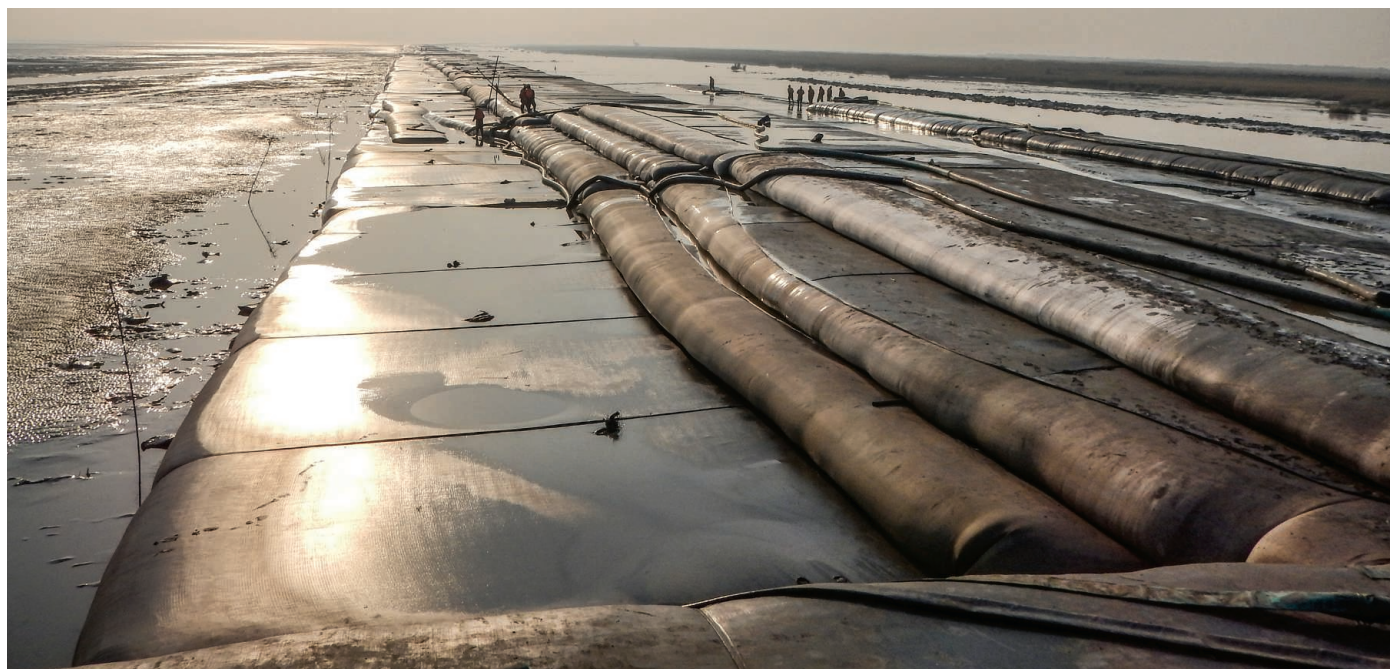
The “new Great Wall.” A seawall that is being built in the Yangtze estuary. Seawalls such as this are creating land and reducing ecosystem services along the coastal wetlands of China. (Right) The ancient Great Wall (yellow line) and the 11,000-km seawall on the coasts of mainland China (red line). The discontinuity of the walls is not visible because of the map resolution.

been increasingly used to enclose coastal wetlands for agricultural and industrial uses over the past several centuries (6, 7). This has caused a great loss of coastal wetlands and their myriad of ecological services.