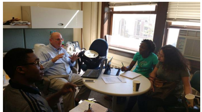
Cross section of poultry value chain research team meeting in East Lansing Michigan