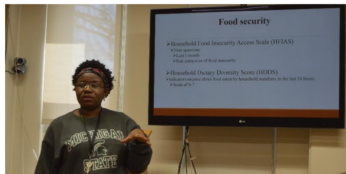
PRESENTING HER PROPOSAL DURING A LAB SESSION

With the knowledge and skills gained from the course, the student will be better able to develop clear research hypotheses that are derived from economic theory, identify research questions and a research design using experimental or non-experimental methods and this will add value to her dissertation research. The audited course CSUS 836 (Modeling Natural Resource Systems) exposed the student to how and why models are used by scientists to address research problems, and to reflect on the philosophical and practical benefits and challenges of using models. It also exposed her to the application of systems thinking in problem solving particularly those related to the natural environment.