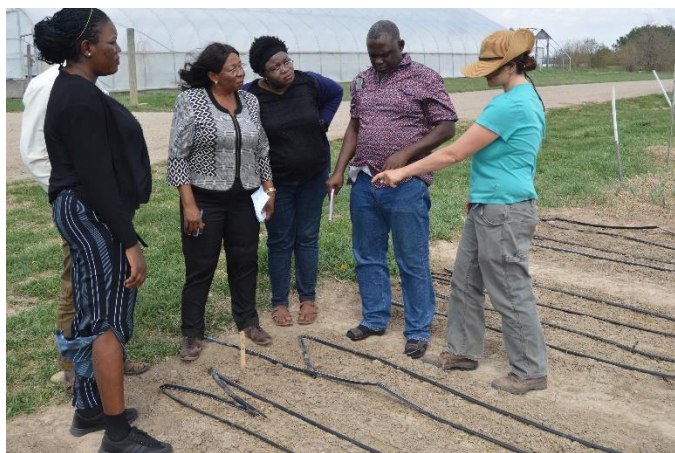
MSU STUDENT ORGANIC FARM USES BEST PRACTICES