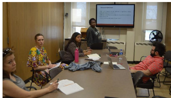
GETTING FEEDBACK ON HER PROPOSAL

She shared her ideas with me on her perceptions of some courses she took at MSU. According to her, the major emphasis of the course AFRE 874 (Empirical Methods in Field Research in Developing Countries) has helped to improve her understanding of the importance of research design, tradeoffs in research designs, and biases induced by different types of designs. It has provided her with an overview of how to measure and test research hypotheses through best practices in questionnaire design, sampling and practical fieldwork guidance. Moreover, the course introduced cutting edge analytical techniques for survey data analysis including treatment effect estimation and heterogeneity, and robustness analysis which she had little or no knowledge of.