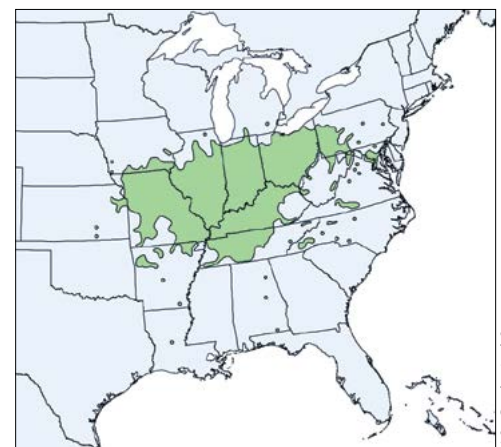
U.S. Geological Survey