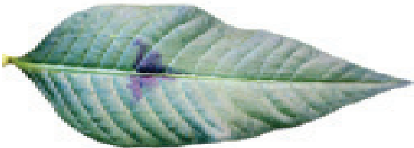
Pennsylvania smartweed leaf.