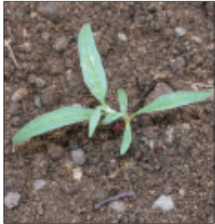
Pennsylvania smartweed seedling.