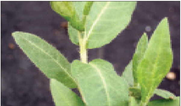
Hairy foliage of swamp smartweed.

Differs by having perennial, creeping, woody rhizomes and usually hairy foliage; found in wetter environment.