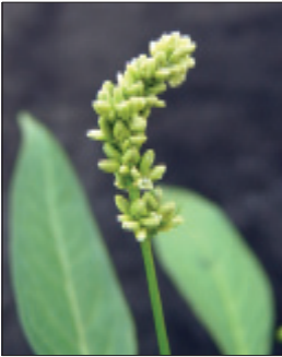
Pennsylvania smartweed immature flower cluster.