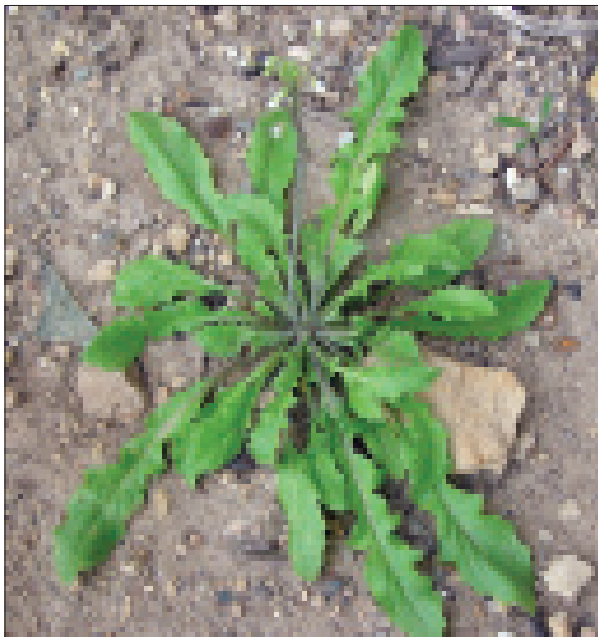
Shepherd's purse rosette.

Leaves initially develop from a basal rosette. Basal leaves are stalked and highly variable in shape; young leaves are first rounded and elongated, becoming variously lobed, toothed to wavy. Smaller stem leaves are alternate with smooth to toothed margins and clasping bases.