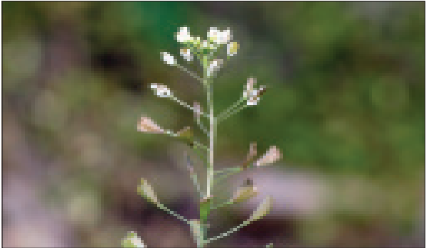
Shepherd's purse flowering cluster.