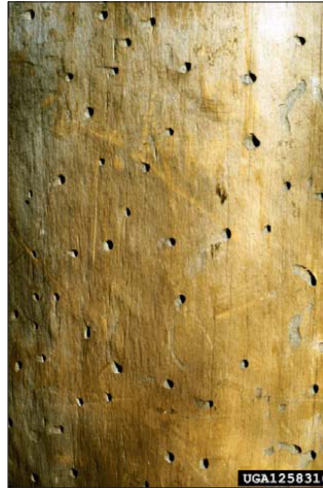
Larval entrance holes

***If you find something suspicious on a susceptible host plant, please contact MSU Diagnostic Services (517-355-4536), your county extension office, or the Michigan Department of Agriculture (1-800-292-3939).***