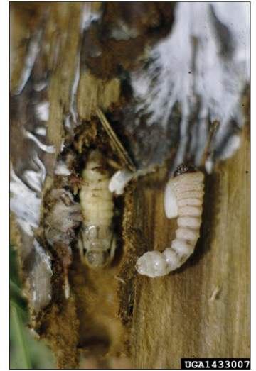
Larva (right) and pupa (left).

may look similar to the exotic black spruce beetle. Positive identification requires examination of adults by a trained taxonomist.