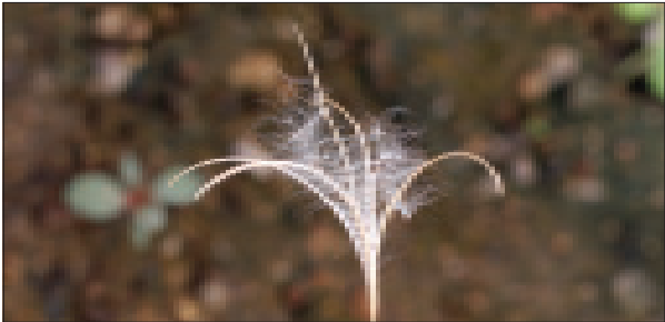
Mature capsule and seeds of northern willowherb.