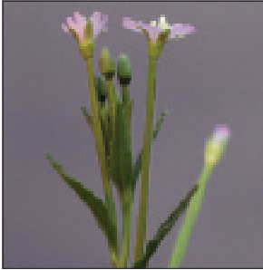
Northern willowherb flowering stem.