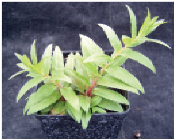
Northern willowherb plant.