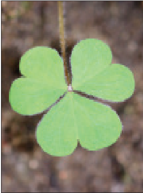
Yellow woodsorrel leaf.