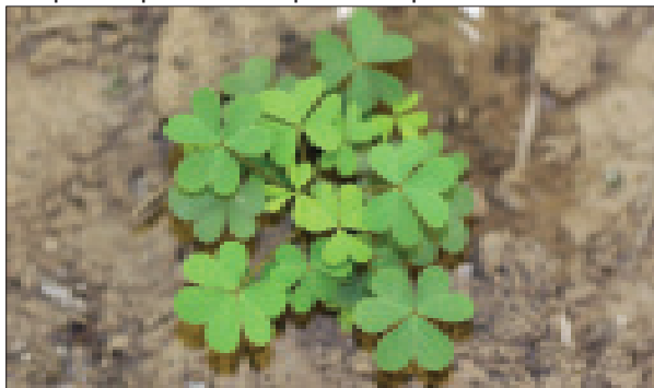
Yellow woodsorrel plant.

Yellow flowers with five petals are found in long-stalked clusters. Fruit are ridged, hairy, cylinder-shaped capsules with pointed tips that