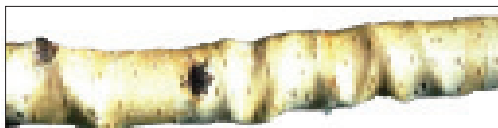
Lumpy branch is symptom of bronze birch borer.