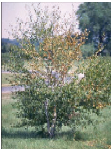
Dieback in upper portion of tree.

around the time that Viburnum opulus or Weigela florida are in bloom.