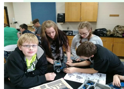
The 4-H After-School Robotics Club in Iosco County received a $1,000 Michigan 4-H Legacy Grant to use VEX Robotics as a

Learn more or apply online at http://mi4hfdtn.org/grants . Questions? Contact the Michigan 4-H Foundation at 517-353-6692.