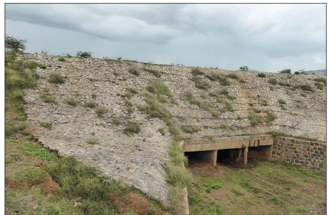
Figure 3. Cattle underfly.