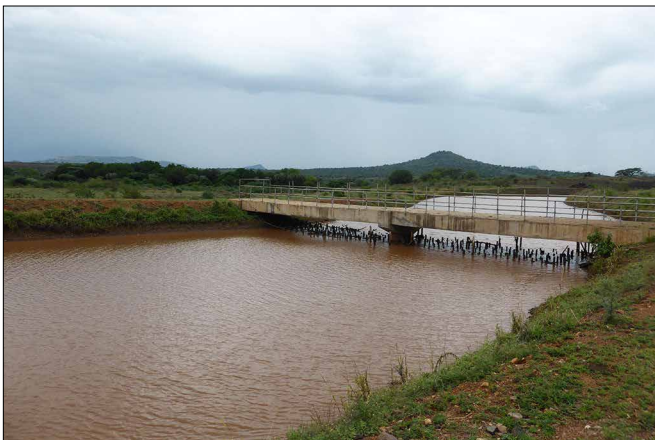
Figure 2. Cattle bridge.

Soil quality and the suitability of land for irrigated sugarcane cultivation vary within the designated project development area. Major limiting factors include drainage conditions (e.g. infiltration rate, hydraulic conductivity etc.) as well as varying levels of soil alkalinity and organic carbon content. Feasibility and design studies for the entire designated project site