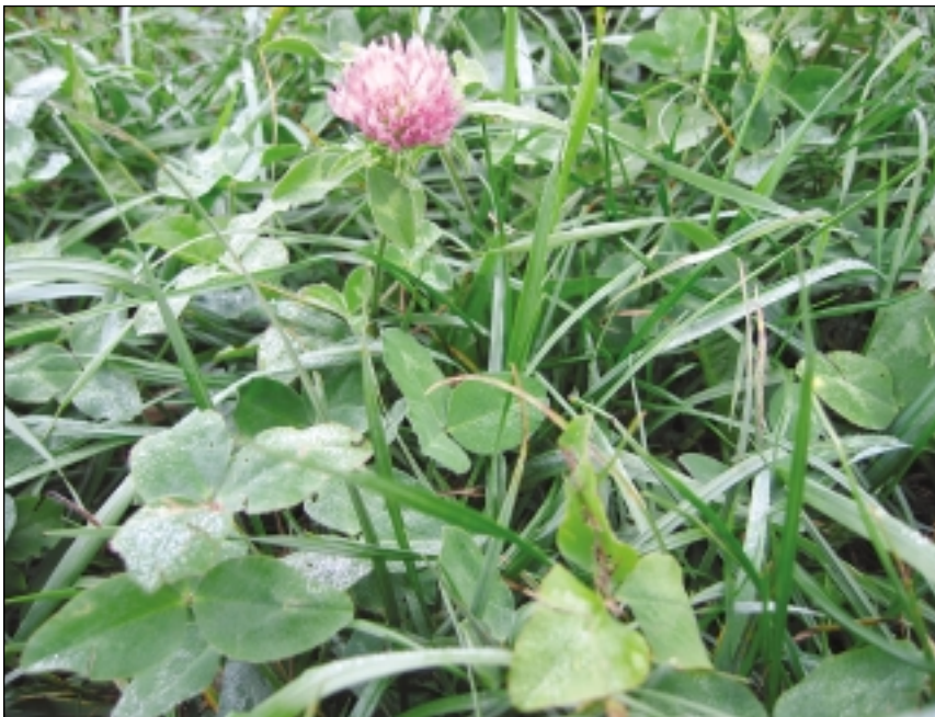
Red clover successfully established into a grass pasture.

Insect Control. Insect damage to grass forages during establishment is generally not a concern, but insect feeding can devastate legume forages, especially alfalfa. Potato leafhopper is the primary insect of concern. Potato leafhoppers can reduce the vigor and later performance of alfalfa seedlings. Proper monitoring and control when the economic threshold has been reached are extremely important during alfalfa establishment. When alfalfa is direct drilled into old sods, grasshoppers can be especially destructive to new seedlings during a dry spell. For more information on insect control in forages, refer to MSU Extension bulletin E-1582, "Insect and Nematode Control in Field and Forage Crops", available from the MSU Bulletin Office, Michigan State University, East Lansing, MI 48824 ($3).