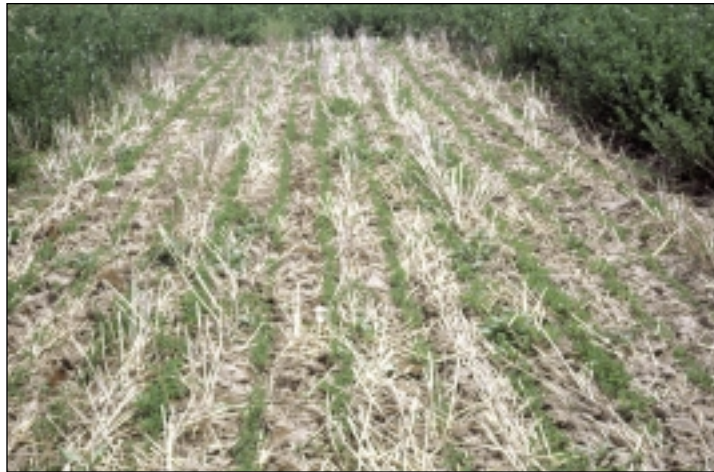
Legume establishment into wheat stubble using a no-till planter.

Non-uniform areas should be subdivided on the basis of obvious differences such as slope position or soil type. Soil samples used for nutrient recommendations should be taken to a depth of 6 inches. When nitrogen fertilizer is on the surface of no-till fields for a number of years, the