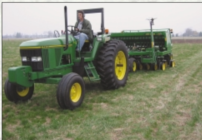
Improving a pasture by no-till seeding legumes into a grass sod.

What are the advantages of no-till in forage production? Firstly, no-till maintains a lot of crop residue that provides a significant amount of organic matter to the soil. Crop residues on the soil