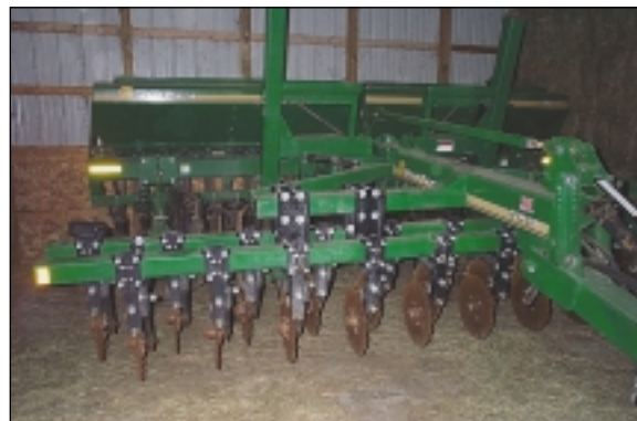
A no-till drill with fluted coulters for ease in cutting through crop residue.