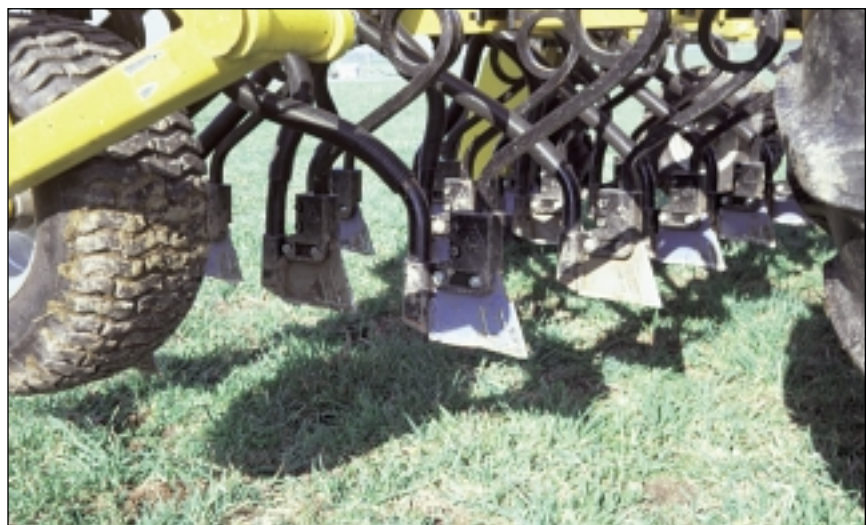
A no-till drill with coil tine and sod-slicing Baker Boot opener without a disc coulter used in overseeding pastures.

When selecting a liming material, it is important to understand differences between them. Lime is calcium oxide. However, in agriculture, "lime" is any Ca or Mg compound capable of neutralizing soil acidity. "Lime requirement" is the amount of material needed to increase the soil pH to a particular point or reduce soluble aluminum.