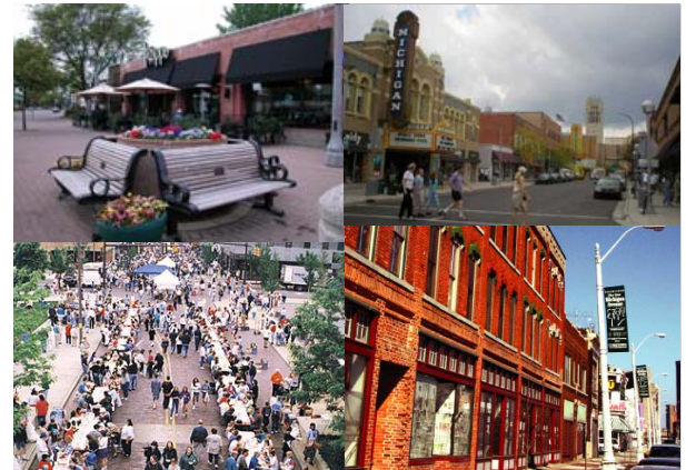
Photos of cities granted 2005 Cool Cities grants: (clockwise from top left) 1. East Lansing, 2. Ann Arbor, 3. Detroit's Corktown, 4. Battle Creek.

Michigan cities created local advisory groups around the idea of "cool cities" and summits around the state gathered public opinion about the kind of place citizens desired. The pilot program initially planned to offer grants to twelve Michigan cities to assist projects that were part of a plan to revitalize a neighborhood. Nineteen cities eventually received these modest grants, but these communities also received preference for other grant programs as part of the State's Cool Cities Toolbox. The State also formed a new government consortium for the project, gathering champions from almost every State department to think about what part each could play in revitalization of cities.