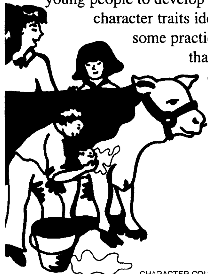
CHARACTER COUNTS SM ! is a service mark of the CHARACTER COUNTS! Coalition, a project of the Josephson Institute of Ethics.

Therefore, the purpose of the 4-H livestock program is to provide opportunities for young people to develop character. The character traits identified and some practices (exercises) that may build character follow.