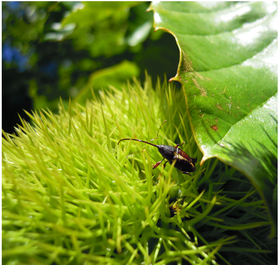
Larger chestnut weevil is 3/8-inch long, the snout is 3/8- to 5/8-inch long.

Lesser chestnut weevil adults likely emerge from the soil during two separate periods in Michigan, once in spring around bloom (May-June) and again in late summer and early fall just before burs open (September-October). Weevils that emerge in the