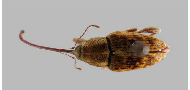
Lesser chestnut weevils are ¼-inch in length and appear orange to brown in color with a snout longer than the length of their body.

timed applications, good sanitation practices and scouting will be the key to successful chestnut weevil management in Michigan.