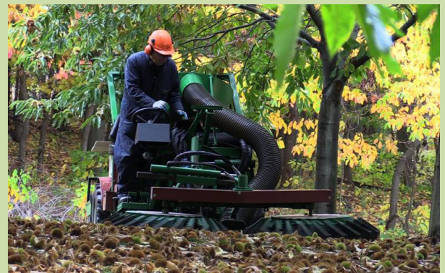
MSU Farm Manager Mario Mandujano tests the FACMA Cimini 180 chestnut harvester on a Michigan chestnut farm. A total of 8,000 pounds of nuts were harvested in a day and a half.

machine is that it not only picks up the nuts, but it separates the full nuts from the flat nuts, as well as the nuts from the burs and other debris. It will not open up closed burs, but if the bur is open and a nut or two are still inside, there is a good chance the nuts will fall from the bur. A two-person operation, debris cleaned from the nuts, flat nuts separated from full nuts, and a very fast harvest time. What more can you ask for?