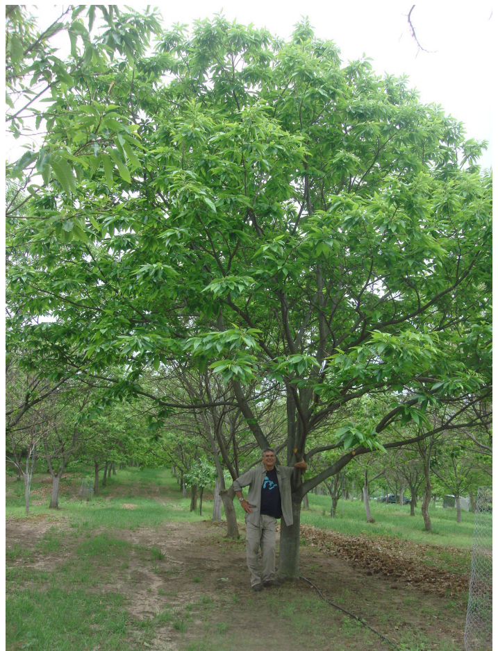
Figure 3: Pictured is Dr. Dennis Fulbright standing next to a 'Marigoule' tree in July 2014 in northern Michigan. Winter-damaged trees can be seen in the background and on the right side of the photo. No winter damage was observed in 'Marigoule'.