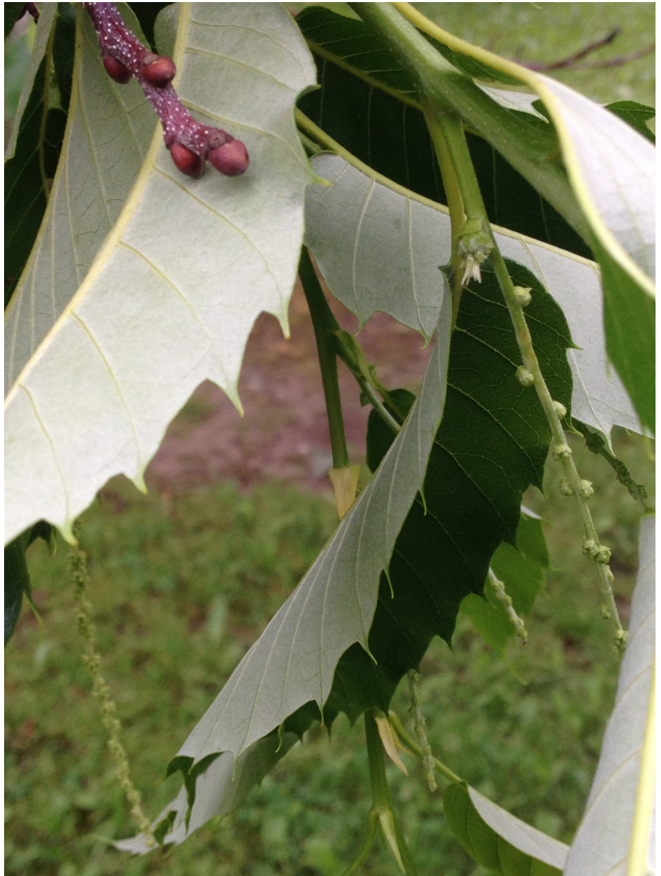
Figure 1. After the winter of 2013-14, some European X Japanese 'Colossal' trees sustained damage to their terminal buds. In this photo, you can see the dead terminal bud and new branches coming up from below the dead terminal with a female flower and typical male-sterile catkins on the new branch. In most cases, only a few inches of the terminal branches were killed. This caused the trees to push new growth from healthy buds six to 12 buds down the branch from the damaged terminal area. This is called lateral budding. Just like after spring frost, when the 'Colossal' trees are old enough, they will not only push the healthy lateral buds, but they will also flower on the resulting branches. That is not the end of the story, however. This flowering does not help if pollen is lacking in the orchard, so you must also think about the recovery and pollen production of the pollen-producing cultivars. Producing 'Colossal' female flowers without pollen is useless. Some growers have only one cultivar in their orchards. If the 'Colossal' flowers become asynchronous with the pollen from the single pollinizing source, trees and pollen may be too early or too late. Therefore, pollination may not occur due to this poor timing, or it may occur, but at such a late date as to not be effective and essentially resulting in partially filled nuts or floaters. Look at the table and all the new choices for pollen-producing cultivars that are or will soon be available. All this means is that an orchard must have controlled DIVERSITY – controlled by the grower who places the correct cultivars in the correct locations.

There is still one more very important characteristic that 'Bouche de Betizac' has that no other nut production chestnut tree has, and maybe you can tell what this characteristic is by looking at the table below. 'Bouche de Betizac' is the only chestnut cultivar resistant to Asian gall wasp. It's not just tolerant, but totally resistant (R). If chestnut trees in Michigan become infested with chestnut Asian gall wasp (some of you say it will happen, while