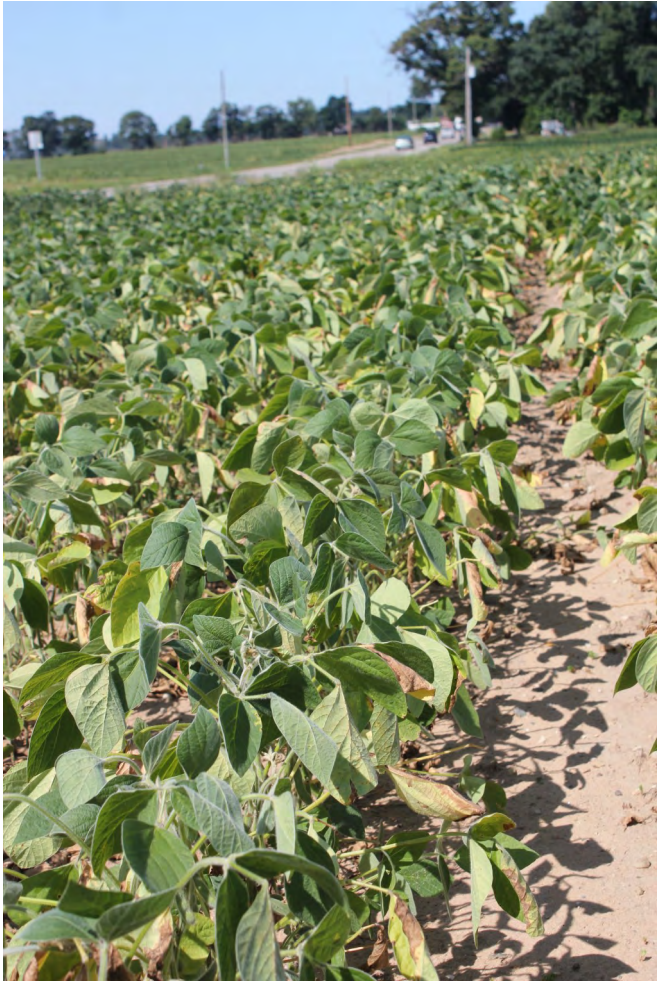
Irrigated soybean plant on the left, dry land area of the field on the right., taken west of Centreville on 8-14-2014. Pictured below is the Anderson's Grain Terminal, west of White Pigeon Mi.