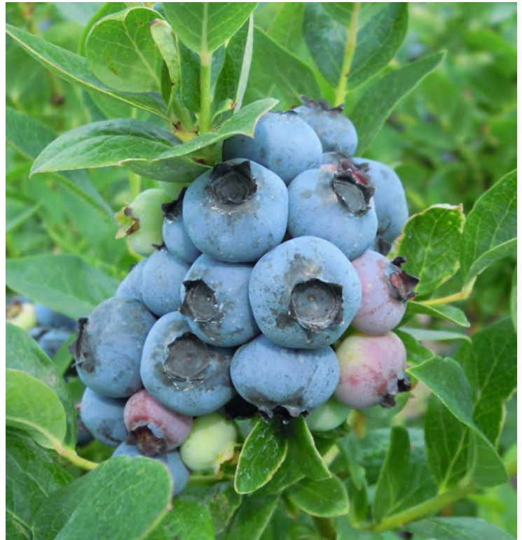
2011 Michigan Blueberry Production Area

When asked if irrigation had increased their yields. 29% said no change, 14% said yields had increased by up to 500 pounds per acre, 16% said between 500 to 1,000 pounds per acre, 33% said yields had increased by over 1,000 per acre.