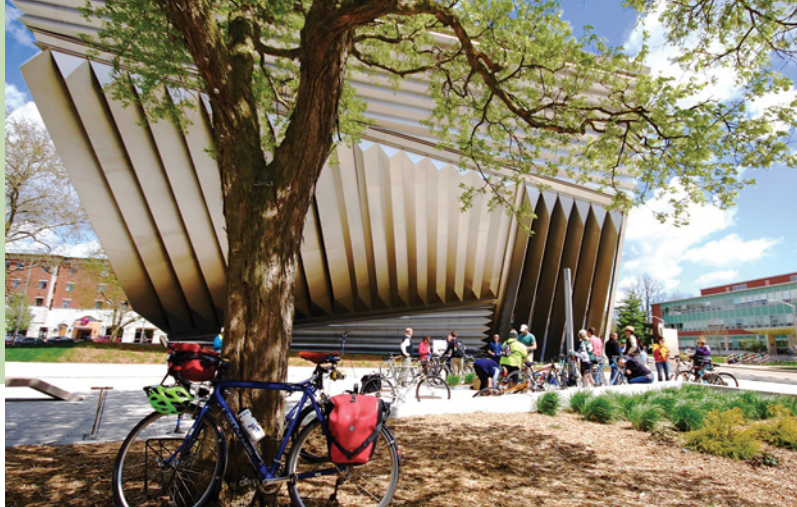
Riders gather at the Broad Art Museum

Next we rode to Hunter Park, an urban agricultural neighborhood food producer. Rita O'Brien, Director of Hunter Park Garden House, provided a guided tour of the hoop house, compost center, free pick-your-own open garden plots, and of course the neighborhood gardens. We learned how the community works together to supply food to themselves, the local farmers market, and to people of less fortunate means. While we were there, two MSU students volunteered to learn more about gardening and to work in the gardens. About 100 yards