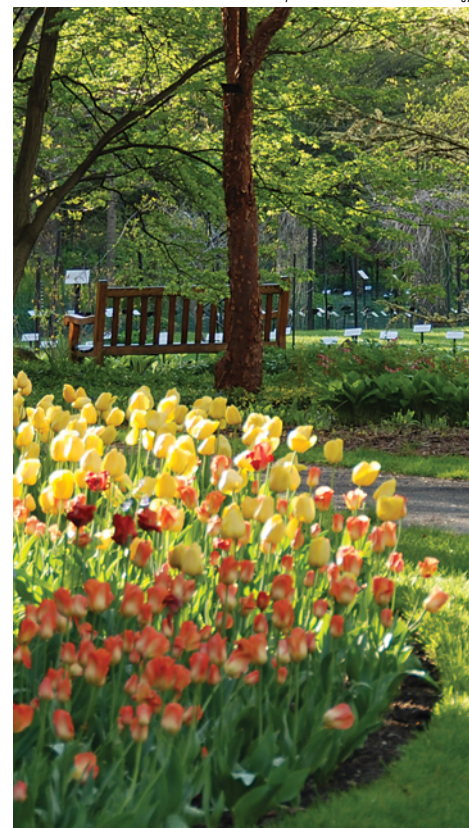
Beal botanical garden