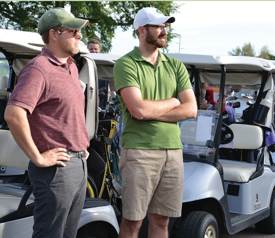
Golfers gather before the shotgun start