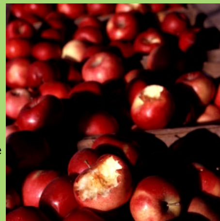
Honeycrisp apples are a high-value crop in the US

The average annual economic impact of bird damage to Honeycrisp apples in MI, NY, OR, WA, and CA was $48 million with a loss of 788 jobs.