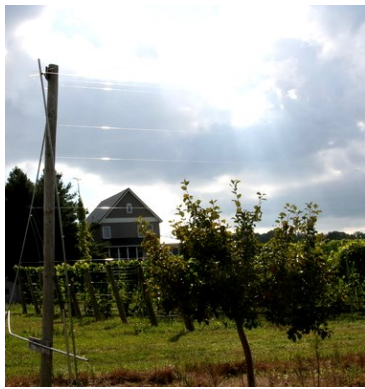
Protective wiring installed around apple trees in an orchard