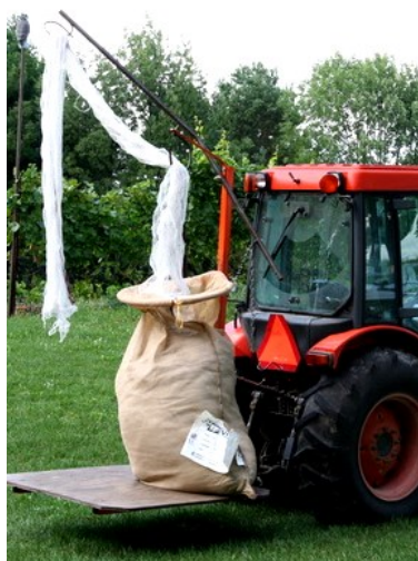
Netting is an effective bird management method reported by growers.