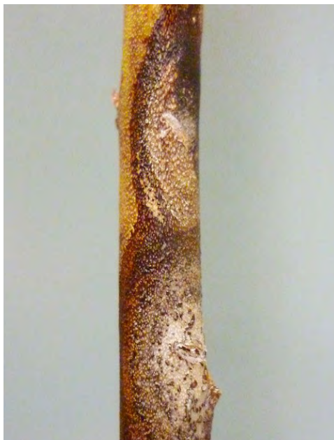
Fig 6. Advanced anthracnose lesions on blueberry stem; Photo: A. Schilder.

This season, it is not just Phomopsis that is infecting blueberries. One might also see unusual lesions on green blueberry canes that are dark brown to black with light brown to gray centers, circular or oval and fairly sharply delineated (Fig. 6). Lesions vary in size, from the several millimeters to over 1 inch in length. Young lesions look like small reddish spots on the stem (Fig. 7). Lesions may be centered around a leaf scar or not (Fig. 8). These lesions are caused by the fungus Colletotrichum acutatum , the causal agent of anthracnose fruit rot. In contrast, Phomopsis lesions tend to be more elongated and uniformly brown, often girdle the entire stem, and may be flattened with more diffuse margins. The lesions may also be mistaken for Fusicoccum canker, but Fusicoccum lesions are usually described as “bull’s eye” lesions and mostly occur in northern growing areas of the state. So far, anthracnose lesions have only been observed in a few Jersey fields, but may be present in other varieties as well. What is most striking are the fruiting