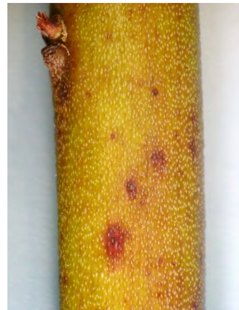
Fig 7. Young anthracnose lesions on blueberry stem; Photo: A. Schilder.

structures (acervuli) in concentric circles on the surface of these lesions (Fig. 9). Acervuli look like small cracked blisters when viewed close-up (Fig. 10). Salmon-pink spore masses may be seen on canes in the field under humid conditions, but if you are not sure, keep cane pieces with lesions on a moist paper towel in plastic container for a couple of days. Anthracnose lesions will produce