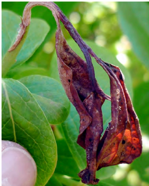
Fig 2. Extreme late stage mummy berry shoot strike. Note the typical Shepherd's crook appearance and the bleached area on the petiole; Photo: T. Miles.

occurred since bloom. Infected twigs may be harder to see with increased foliage, which probably explains the apparent reduction. Twig blights can lead to wilting of developing fruit clusters due to death of the vascular tissue leading to the cluster. Mummy berry shoot strikes have almost completely disappeared in all four