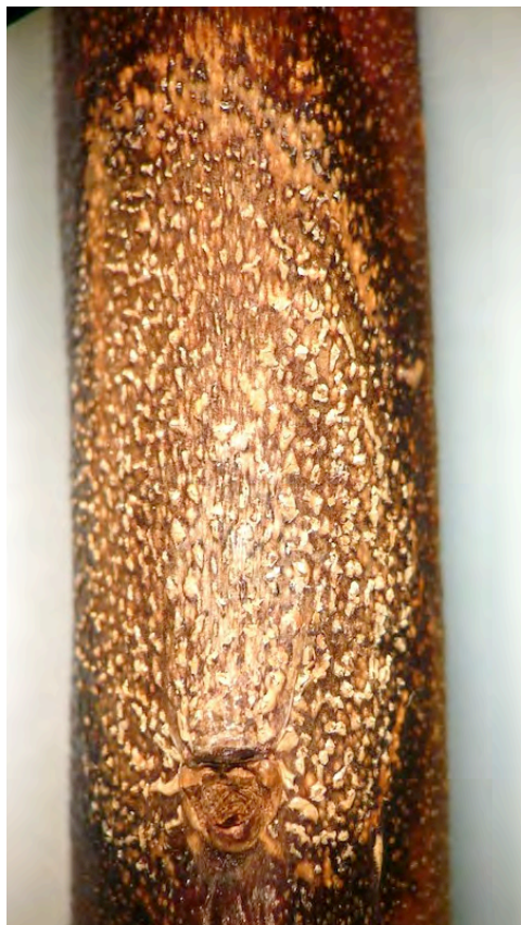
Fig 9. colletotrichum acutatum fruiting structures (acervuli) in ring-like pattern around leaf scar; Photo: A. Schilder.