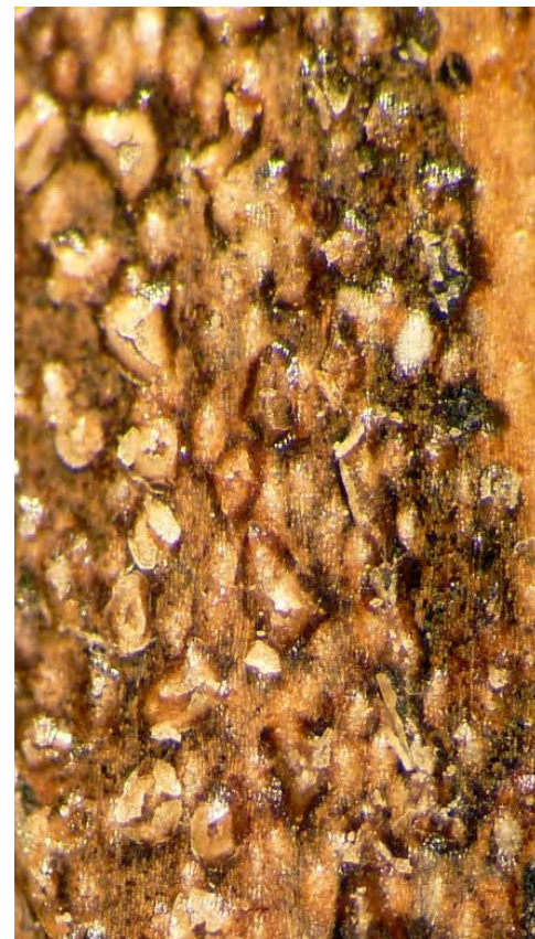
Fig 10. Close-up of blisterlike acervuli of C. acutatum

The occurrence of anthracnose cane lesions is rare, though it has been reported before by researchers in Japan and was observed in Ontario and Michigan in 2003 and 2004. The infections likely took place in 2009 and may be related to the rainy weather later in the season, which may have provided sufficient wetness to allow infection of young green canes at a time that spores were abundant, e.g. during fruit ripening and harvest season. In addition, some canes were extremely vigorous probably due to heavy fertilizer use. While studies have not been done specifically to determine the best methods to control cane anthracnose, they are likely to be similar to those that would be employed for Phomopsis: pruning out diseased and dead canes, applying lime sulfur as a delayed dormant spray, and fungicides on a regular basis through the season. The same fungicides that work against anthracnose fruit rot will work against cane infection: Bravo, Captan, Ziram,