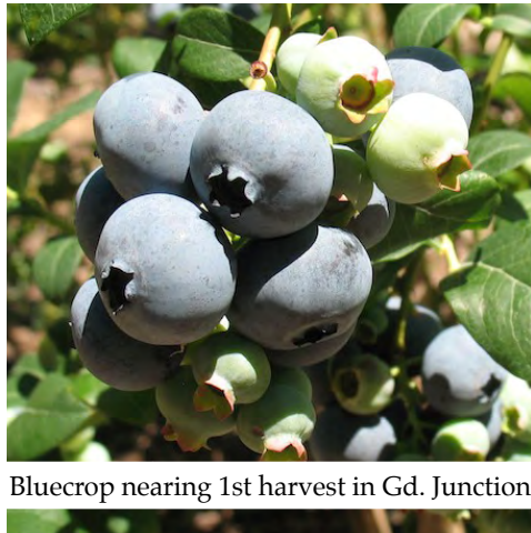
Bluecrop nearing 1st harvest in Gd. Junction

Crop development. In Van Buren County, Jersey in Covert is at fruit coloring, and Bluecrop and Blueray in Grand Junction are about 7-10 days from first harvest. In Ottawa County, Blueray in Holland, and Rubel and Bluecrop in West Olive are at fruit coloring.