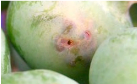
Fig 11. Look out for developing fruitworm damage, seen as a small entry hole or early-ripening fruit and/or insect frass. Single berry damage typical of cherry fruitworm feeding or early cranberry fruitworm feeding (ABOVE). Multiple berry damage indicative of advanced cranberry fruitworm feeding (BELOW); Photos: K. Mason.

Cherry fruitworm moths and eggs were not observed at any of the monitored farms. Single berry damage (cherry fruitworm or early cranberry fruitworm feeding) was observed at all farms, and the amount of damage this week was very similar to what was found last week (Fig. 11). Damage levels still