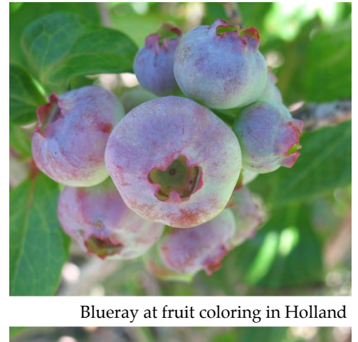
Blueray at fruit coloring in Holland