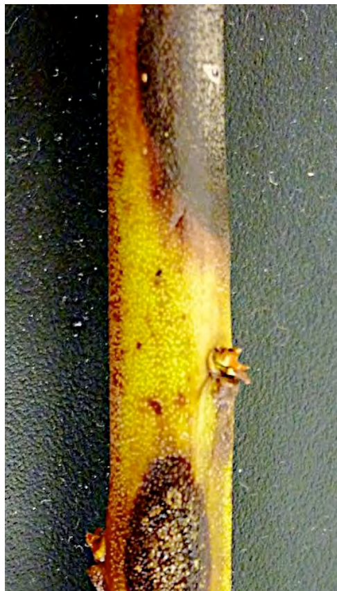
Fig 8. Anthracnose lesions on blueberry stem no associated with leaf scars; Photo: A. Schilder.