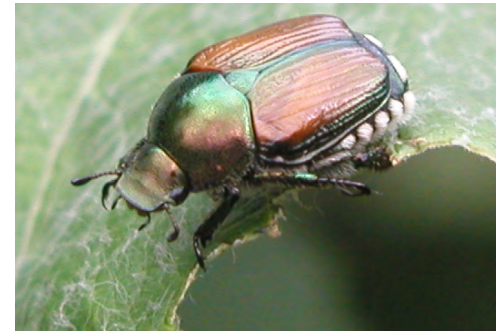
Fig 12. Adult Japanese beetle; Photo: P. Jenkins.

Japanese beetles are emerging (Fig. 12). All of our monitored fields were scouted for Japanese beetle, and beetles were seen at the Covert and Holland farms. Japanese beetle feeding damage was not observed on leaves or fruit. Fields should be monitored weekly until last harvest for the presence of Japanese beetles. To monitor for Japanese beetle,