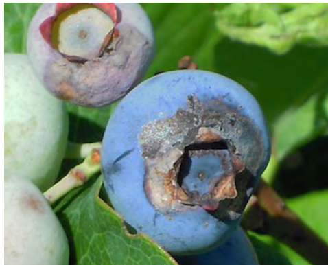
Fig 1. Frost damage near the calyx cup on some berries; Photo: M. Longstroth.

The last week of June was like the rest of the month with highs near 80 and lows near 60. Thunderstorms and unsettled conditions marked the week's weather. Most rain fell on Tuesday, Wednesday and Sunday, with accumulations of one to three inches. June has been very wet. June's rainfall totals were very variable; areas to the south and close to the big lake received 8 to 10 inches while areas away from the lake received only about 5 to 6 inches. Growing Degree Days (GDD) are ahead of normal, and fruit is ripening about 7 to 10 days ahead of normal. Soils are wet, and ponding in the fields is common. The forecast this