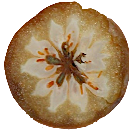
Fig 4. Mummy berry infected fruit showing the fungus completely colonizing the carpels and beginning to lay down a thick outer wall in preparation for overwintering; Photo: T. Miles.

scouted plots, and have likely fallen off due to wind and rain in recent storms. Figure 2 shows a late-stage mummy berry shoot strike, which can be identified by the "shepherd crook" shape and the bleached area in the "crook". A few mummy berry-infected fruits were just starting to show external symptoms on the bush and on the ground (Fig. 3) at two of the sites near Grand Junction and West Olive, with the highest average being 2.8 newly mummified fruits at the West Olive site. Most of the infected berries were not showing external symptoms but internally the infected berries had significantly more fungal growth when compared to two weeks ago (Fig. 4). Do not confuse mummy berry symptoms with those of cranberry or cherry fruit worm infection, which may lead to partial purpling of berries. However,