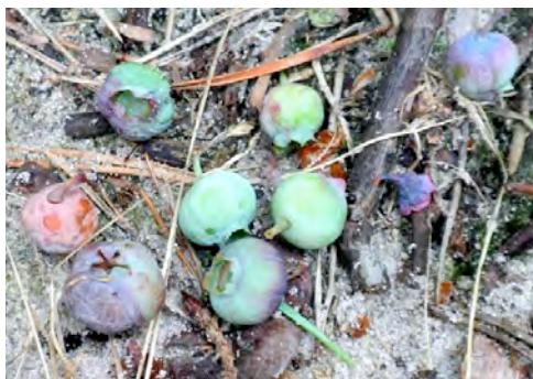
Fig 3. Mummy berry infected fruits that fell to the ground. Note the wrinkled appearance, lack of insect damage (no holes), and the partial tan to purple discoloration of the berries; Photo: T. Miles.

occurred since bloom. Infected twigs may be harder to see with increased foliage, which probably explains the apparent reduction. Twig blights can lead to wilting of developing fruit clusters due to death of the vascular tissue leading to the cluster. Mummy berry shoot strikes have almost completely disappeared in all four