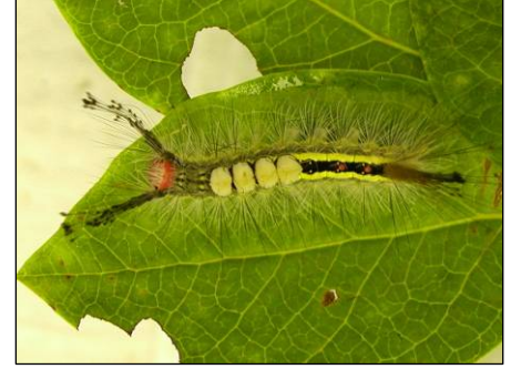
Mature tussock moth larva

Tussock moth can cause problems during harvest for blueberry growers, because the larvae can contaminate machine-harvested berries and also because these insects cause skin rashes (tussockitis) on hand pickers who come in contact with their hairs. The second generation larvae should have hatched by now and will be getting bigger during harvest of the later blueberry varieties. Mature tussock moth larvae are large (3-5 cm long) and hairy with distinctive yellow, black, and red coloration.