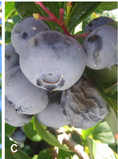
Figure 1. A) Humidity and berry wetness can contribute significantly towards infection (e.g., at least 12 hours of fruit wetness is required for Colletotrichum acutatum to penetrate the berry surface). B) Anthracnose fruit rot symptoms in the field, notice the orange sporulation (arrow) (Grand Junction, MI). C) Alternaria fruit rot symptoms in the field, notice the green velvety growth (arrow) (Covert, MI). These spores can infect nearby healthy berries.