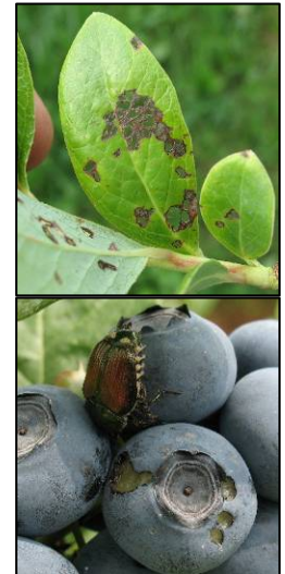
Top: Leaf feeding by Japanese beetle.

Begin scouting for Japanese beetle in mid to late June. Visually scan the canopy of 10 bushes on the field border and 10 bushes in the interior of the field. Count the number of beetles observed. As beetles are very mobile, check for the presence of feeding damage on leaves and fruit to let you know if beetles have been active in the field recently. See pictures above for examples of fruit and leaf feeding.