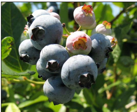
Jersey ready for first harvest at Covert.

In Ottawa County, Blueray are undergoing first harvest in Holland. Rubel are within a week of first harvest and Bluecrop is ready for second harvest in West Olive.