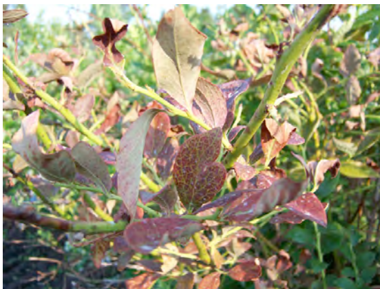
Picture 1. Blueberry leaves in affected bushes.

There are some issues related to blueberry plant health resulting from the intensive rains that we had in the past. Fields that were flooded for several days are showing plants with die-back and intensive defoliation. Leaves on affected bushes showing brown spots that later on become necrotic (see picture 1). Damaged plants are located in sandy soils and the symptoms follow a pattern along the rows. New growth in affected plants shows deformed leaves and sparse foliage. The most damaged bushes are completely defoliated (see picture 2). So far, tissue samples have been sent to de MSU lab for identification but some preliminary reports indicated that no plant pathogen is associated with these symptoms. Thus, we are leaning to believe that the damage could be herbicide related. Because of the intensive rains and flooding it is possible that pre-emergent herbicides applied early in de season could have been translocated to the root zone and absorbed by the plant. However, we are waiting for the grower's herbicide application records in order to make better determination.