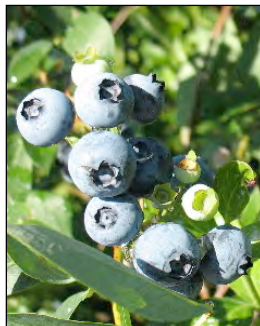
Blueray ready for second harvest in Grand Junction (left), and Rubel ready for first harvest in West Olive (right).