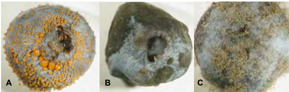
Figure 1. Fruit rotted at 100% humidity for 7 days post harvest. A) Anthracnose 'ripe rot' B) Alternaria fruit rot C) Botrytis fruit rot