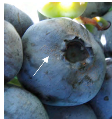
Figure 1. Anthracnose fruit rot symptoms in the field, notice the orange sporulation (arrow) (Covert, MI).

Scouting for fruit rots in the field at this time can give an indication whether fungicide sprays are needed.