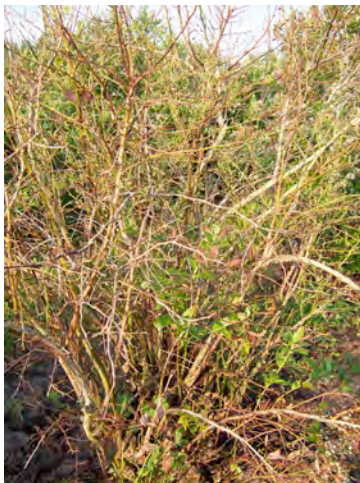
Picture 2. Blueberry bush with intensive defoliation.