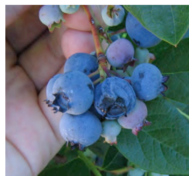
Figure 2. Alternaria fruit rot symptoms seen in the field; notice the dark green to black sporulation and shriveling around the calyx cup (Covert, MI).