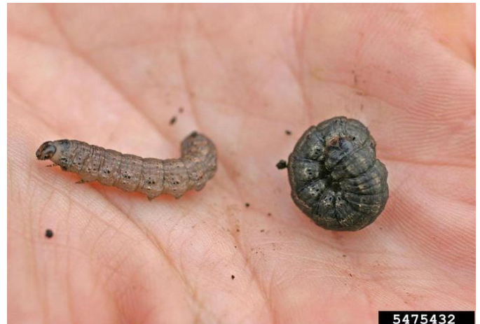
Figure 2. Black cutworm larvae. Notice the smooth appearance as well as the characteristic “c” curl of the larvae on the right.

The larval stage is the damage-causing life stage, though only the older caterpillars cause significant damage. Young larvae feeding often goes unnoticed, as it manifests itself as small holes in the leaves of vegetables and weeds. Once larvae reach approximately 0.5-0.75 inch in size, damage is noticeable (described below) and larvae can be hard to control.