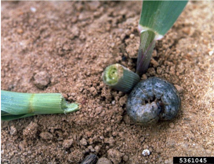
Figure 3. A large black cutworm larva curled in the c-shape next to a recently cut plant. Sometime larvae will pull the cutting into a hole and feed further.

Black cutworm is capable of feeding on a wide range of vegetable crop seedlings, transplants, sweet corn, tomatoes, vine crops and cole crops.