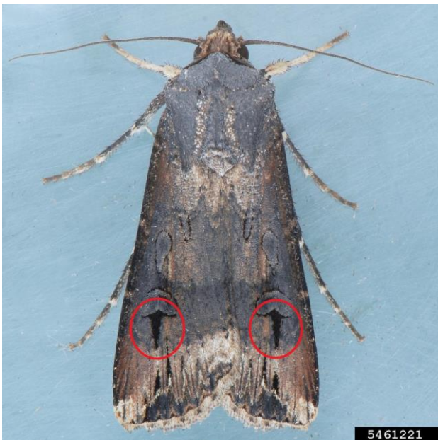
Figure 1. On black cutworm moths, look for an overall dark appearance as well as two daggers on the back portion of the front wing.

The larva of black cutworm causes sporadic damage, primarily stand loss, to young crop seedlings. Adult black cutworms are a moth that migrates into Michigan from the southern U.S. and Mexico every year from early May to mid-June. The arrival of the adult moth is aided by weather fronts moving from southern to northern areas. They are often detected in pheromone monitoring traps just after the passage of these weather systems.