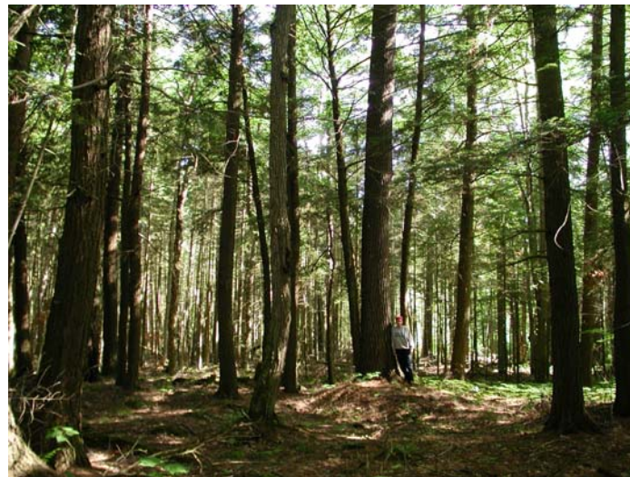
An old-growth conifer grove on Neebish Island. These will be maintained and improved.