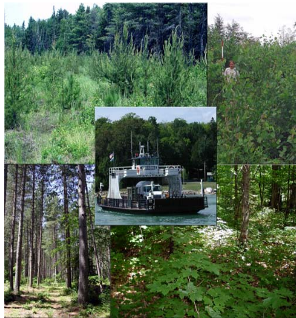
Clockwise from top left: (1) Young pine plantation, (2) 2-year-old aspen regeneration in a clearcut, (3) sugar maple seedlings wait for release, (4) high-value red pine poles in a managed plantation, and (4) the Neebish Islander II – gateway to the island.