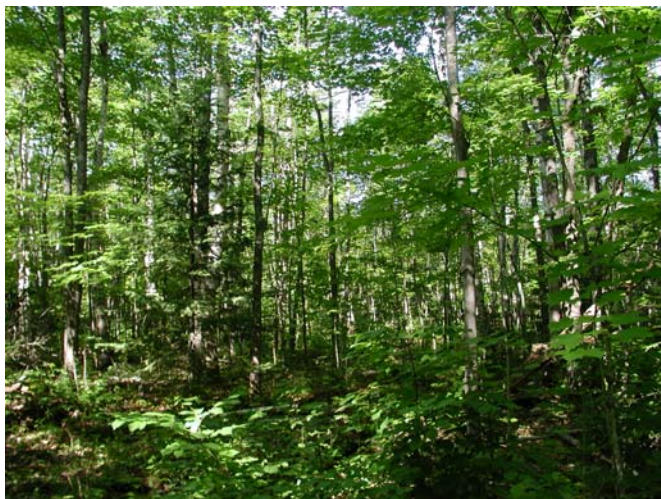
Hardwood regeneration is suppressed by over-mature aspen and birch. Young seedlings will be released and allowed to develop into a new forest.

The result has been that the forests of the island have developed without any plan for the last 80 to 100 years. Forest types have not changed appreciably from pre-industrial times, except that hemlock-white pine stands in the center of the island are no longer intact. The forests are still primarily dominated by aspen and birch and contain a mixture of maples, firs, oaks, and a few other species. However, today’s forests are aging, poorly stocked, growing slowly, and gradually changing as the over-mature aspen and birch give way to other hardwood species and balsam fir. Without active management many of the remaining forests will gradually convert to low productivity stands of red maple and balsam fir.