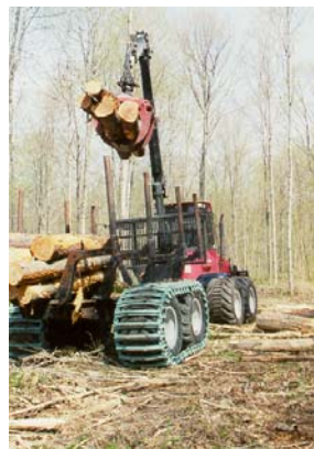
Advanced, low-impact harvesting equipment will be used.

Forests change and develop slowly, but with patience and persistence we will see increased diversity and productivity soon in the woods of Neebish Island as a result of our actions today.