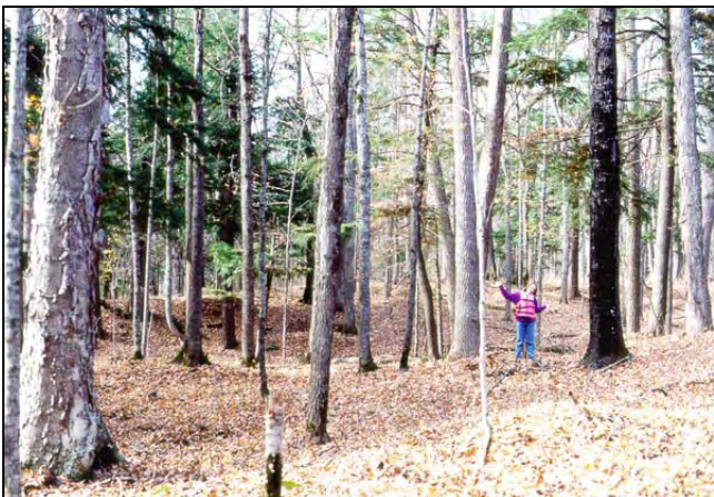
Northern hardwood forest, the most common forest type in Michigan.

Stated most simply, biomass is tissue produced by living organisms. In an ecological sense, it is usually measured in dry weight per unit area, such as tons per acre. In a forest, trees produce huge amounts of biomass. Wood is one form of that biomass, along with leaves, bark, flowers, fruit, etc. Woody biomass has been used by humans for millennia for a variety of purposes. Wood is one of the most common (and ecologically friendly) raw materials that society uses. In current markets, and with growing concerns about carbon and fossil fuel consumption, biomass has come to mean a potential alternative fuel source for energy. Of course, woody biomass has been used as an industrial and residential fuel for a long time. Yet, emerging technologies are changing the face of that market.