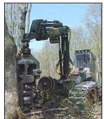
Harvesting processor at work.