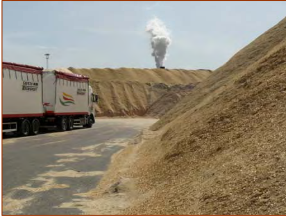
Piles of shredded wood at a large pellet manufacturing facility.

geographical distribution of forests and forest types, ownership patterns, procurement systems, and other variables.