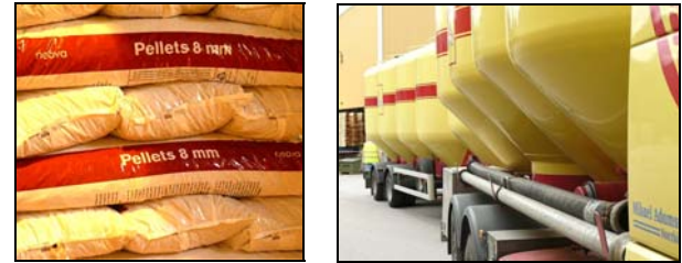
Bagged pellets for the home market and bulk pellets for commercial consumers.

Forest certification by third parties may limit access to certain energy markets, such as power plants that are regulated by state renewable portfolio standards (RPS). These are the laws that make utilities provide a specified percentage of their power from renewable sources by a certain year, such as 10 percent renewables by 2015. The regulations often define woody feedstocks as only those from certified forests. Most individual and family forest owners do not have their forests certified. Certified requirements effectively exclude