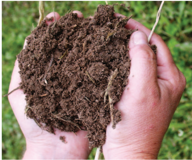
Fig. 1. Soil organic matter quality varies depending on plant inputs and management practices.

This bulletin describes the agronomic practices you can use to build SOM and the scientific underpinnings of those practices. We encourage farmers, farm advisors, agency personnel and other stakeholders to use the information presented here to improve their crop and soil management plans to increase SOM. Part of this effort should include on-farm experiments, which are an important step in adapting recommendations to specific regions and cropping systems.