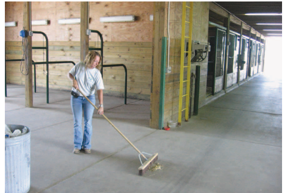
This alley is kept clean and has good footing and lighting. A separate grooming area on the left keeps tied horses out of the traffic flow.