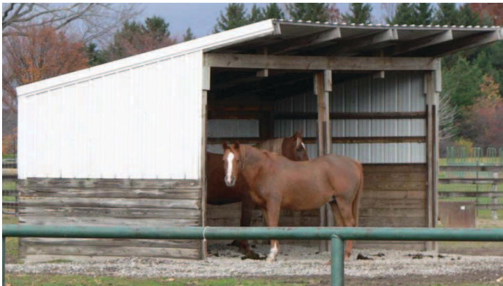
A simple three-sided shed offers protection from harsh weather while providing good ventilation and a natural environment for the horse.

Livestock species all have different housing requirements based on their physical and behavioral needs as well as the amounts and types of exercise and activities in which they participate. If you prioritize the creature comforts of people over horses, you are sure to develop a facility that houses sick horses with behavioral problems. However, if you design a horse facility that provides a safe and healthy environment for the horse, you will ultimately have a functional and cost-efficient facility. Understanding some horse behavior fundamentals and housing requirements for the optimum health and well-being of horses is essential before you can design or renovate a functional horse facility.