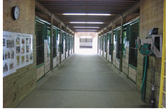
This barn alley is wide enough to handle two-way traffic of horses. The alley is free from objects that could cause injury to a horse if they spooked. The stalled horses cannot reach out and bite horses in the alley.

Ideally, barn alleys should be free of objects like tack boxes and saddle racks that can be a hazard to horse and human traffic. In addition, stalled horses should be fully enclosed (with bars or mesh for visibility) so that they cannot reach out and bite horses or people as they walk by. Finally, in alleys with high traffic, as well as different experience levels of handlers and horses, it is recommended that horses are not tied in the alley, either by cross ties or tied to the side wall. Always make sure that horses pass “left to left,” making sure the handlers are between the horses to allow them to swing a horse’s hindquarter away from the other horse/handler if it tries to kick.