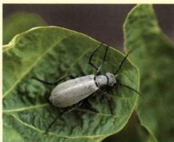
Ash gray blister beetle