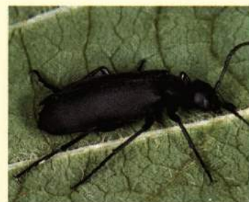
Black blister beetle

Nitrates , high levels in hay or pasture High levels of nitrates may cause death. Symptoms include increased salivation, labored breathing, uncoordination, weak pulse, muscle tremors, vomiting, diarrhea, and suffocation. A characteristic finding is the chocolate discoloration of the blood and blueness of membranes. Some weeds—pigweed, lambsquarter, and nightshade—naturally accumulate nitrates. Grasses heavily fertilized with nitrogen (including manure) or produced under drought conditions may have toxic levels of nitrate and should be tested prior to feeding. If in doubt, have hay tested at any forage testing laboratory.