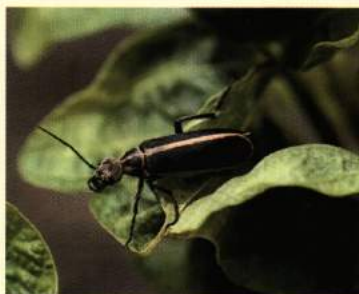
Margined blister beetle

Blister beetles (four types: striped, black, ash gray, margined) Blister beetles produce a toxic compound, cantharadin. Consuming as few as 12 beetles, even if they are killed or smashed during the hay-making process, can kill a horse. The beetle is rarely present in first cutting alfalfa. Subsequent cuttings should be made before bloom since the insect is attracted to flowering alfalfa. Blister beetles are more commonly found in hay produced in the southern United States and in periods of drought when grasshoppers are present.