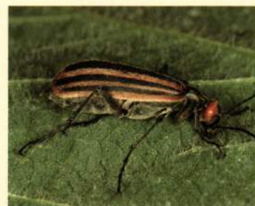
Striped blister beetle