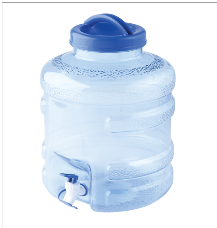
Bottled water can be purchased in multi-gallon containers.

Water cooler services are also available in some areas of Michigan and are regulated as bottled water. These services may involve rental of a water cooler and payment for the delivery of water refills.