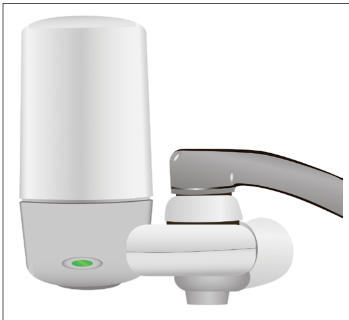
Activated Carbon – Faucet Model

GAC treatment systems use replaceable cartridges containing granular block carbon. In general, cartridges with higher amounts of carbon are more thorough at removing contaminants and last longer, thus increasing the life of each cartridge. Under-the-sink models typically contain more carbon, are more convenient and perform better than faucet and countertop models. A system that can also dispense unfiltered tap water for purposes other than drinking and cooking will extend the life of the cartridges.