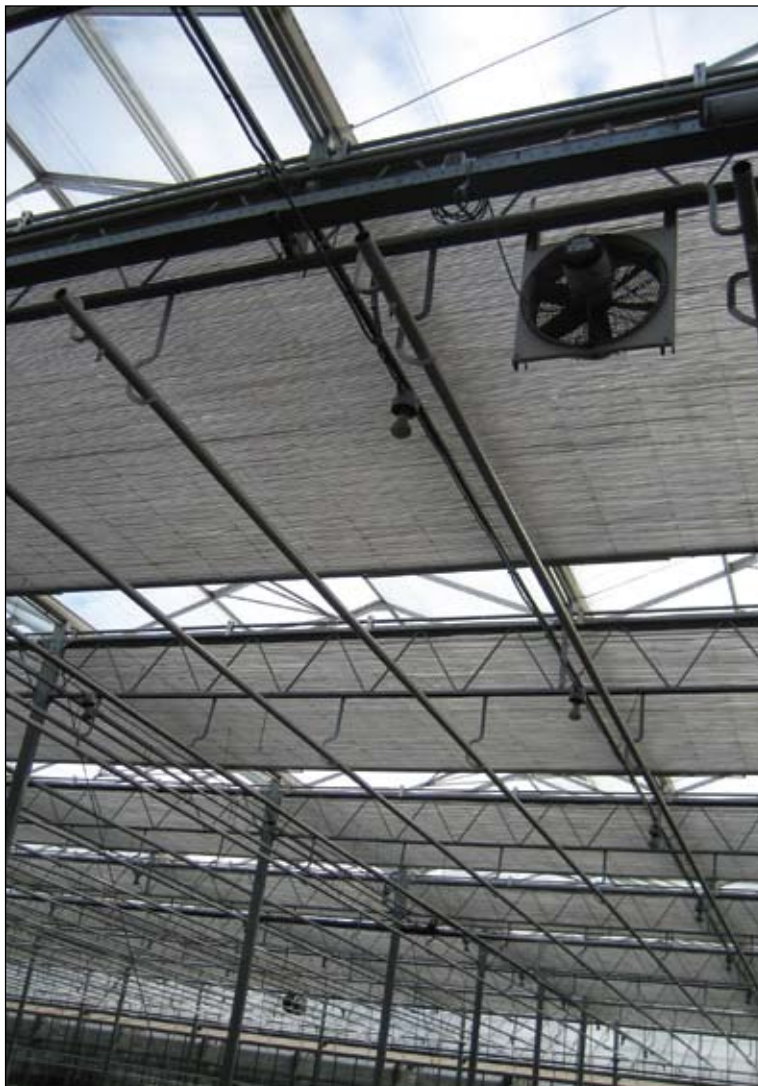
Heat loss through the roof of high profile greenhouses can be reduced by installing energy curtains.

Therefore, it is imperative that sensors are routinely inspected to make sure they are