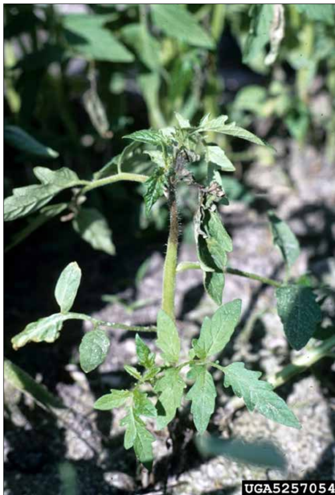
Late blight, Phytophthora infestans (Mont.) de Bary, symptoms.

some efficacy against the late blight pathogen. Some formulations (but not all) are organic. I recommend that organic gardeners check with the OMRI database ( www.omri.com ) to verify whether or not a particular fungicide meets organic standards. As with the fungicides listed above, these products must be used preventatively to be most effective.