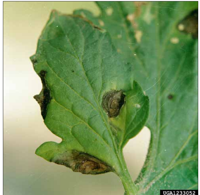
Early blight, Alternaria solani Sorauer, symptoms.

Answer. Crop rotation refers to the practice