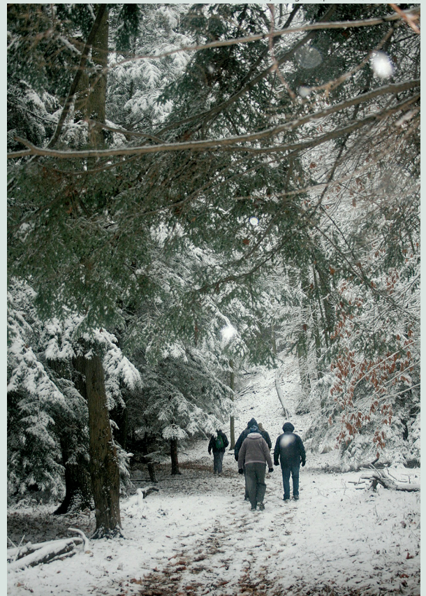
Heidi Frei, Michigan Dept. of Natural Resources

Inventory data from 2014 indicate that more than 173 million hemlocks grow in Michigan forests, and thousands more have been planted in landscapes. Though hemlock is most abundant in the extensive forests in northern lower and upper Michigan, it is locally common in other areas of the state in private woodlots, game management areas, public parks and recreation areas. Much of the hemlock resource in Michigan forests consists of relatively old trees. This age-class distribution reflects years of preferential browsing by deer on young, regenerating hemlock. More than 93 percent of the 1.08 billion cubic feet of hemlock volume in Michigan consists of sawtimber-sized trees.