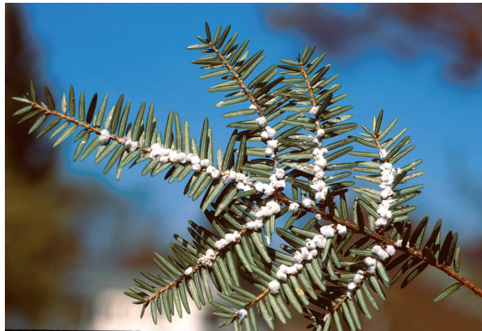
Hemlock shoot with hemlock woolly adelgid.

Michael Montgomery, USDA Forest Service, Bugwood.org