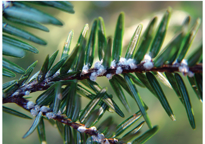
Elongate hemlock scale (left) feeds on hemlock needles. Hemlock woolly adelgids (right) feed in white ovisacs at the bases of needles.