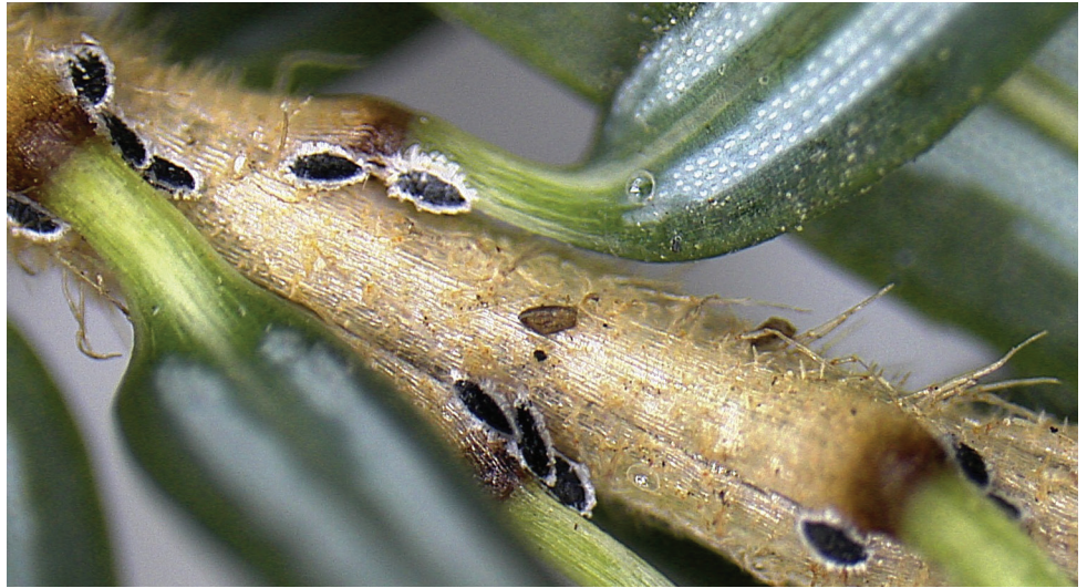
Immature HWA sistens nymphs are dormant and do not feed in summer.

insert their long stylets into the woody shoots to begin feeding, they will not move again. As the adelgids feed, they produce the strands of white wax from special glands on their bodies. The word “progreadiens” comes from a Latin word meaning “to progress.” This generation of HWA does not require a long diapause period, and development “progresses” relatively quickly to the adult stage.