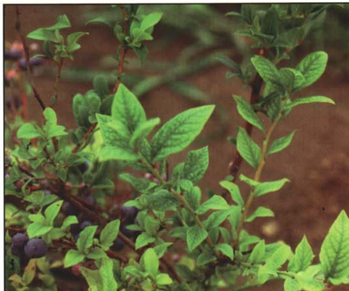
Figure 5. Iron-deficient plants have chlorotic leaves with green veins. Symptoms develop first on the young leaves at the shoot tips.

Iron (Fe). Symptoms of Fe deficiency are common in blueberries. Deficiency causes the tissue between veins to develop a light yellow to bronze-gold chlorosis. Symptoms differ from those associated with Mg deficiency in that the