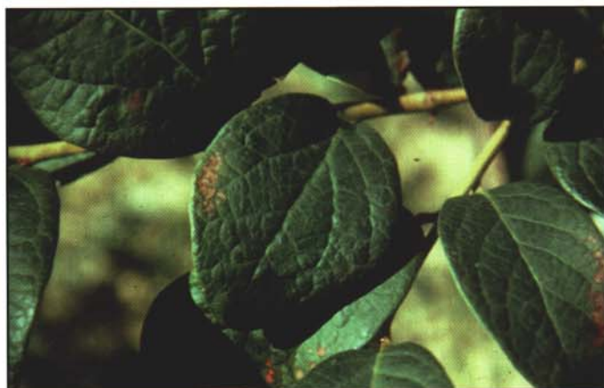
Figure 3. Scorching or necrosis along margins of leaves caused by potassium deficiency.