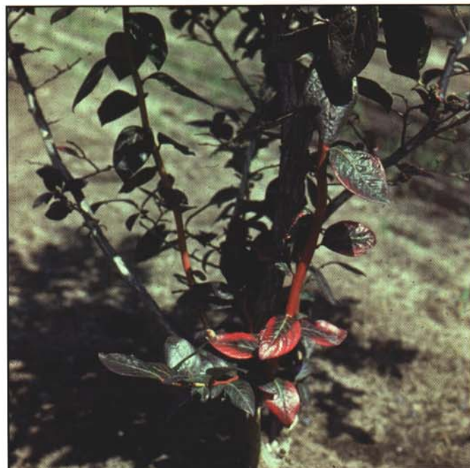
Figure 4. Outer portions of magnesium-deficient leaf turns yellow to bright red, while middle of leaf remains green. Symptoms usually develop later in the season on leaves at the bases of shoots.

These regions may turn yellow to bright red while tissue adjacent to the main veins remains green. Leaves at the bases of canes and shoots show symptoms first. Young leaves at the tips of shoots are seldom affected.