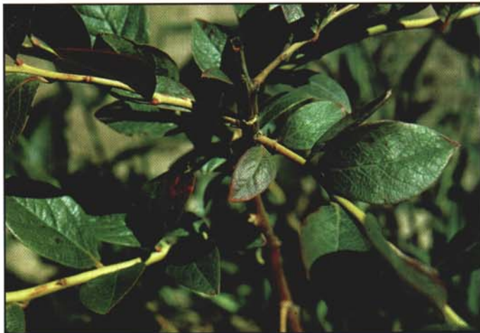
Figure 2. Dark green-purple color of phosphorus-deficient leaves.