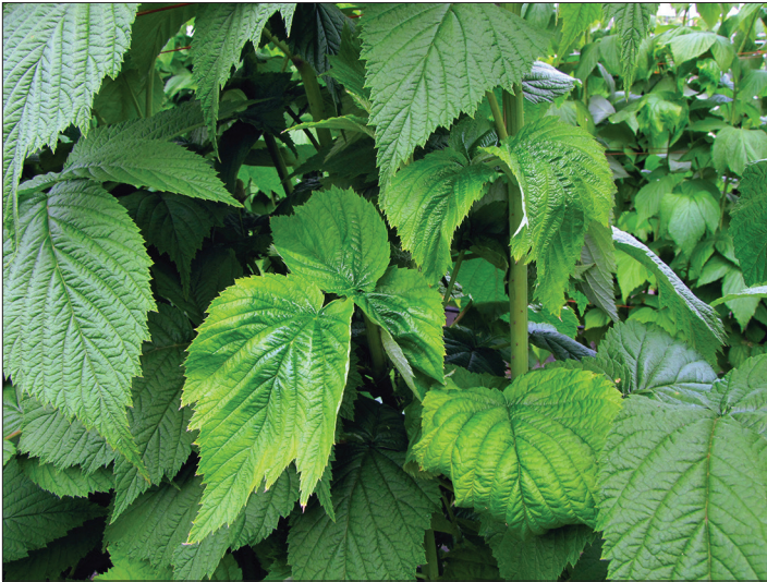
Leaves yellowing and curling from potato leafhopper damage.