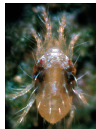
Two-spotted spider mite (above) and its damage (right).

Two-spotted spider mites can also be a serious pest of tunnel raspberries because they thrive in hot, dry tunnel conditions. Outbreaks may be severe during hot summers and absent during cooler years. The primary management approach is to adequately vent the tunnel to lower temperatures when they reach 80 F. Predatory mite species are also available for purchase and may help suppress populations if they are introduced before the spider mite populations have become a problem. Mite problems are increased by applying pesticides to control SWD since the pesticides also kill beneficial insects , including predatory mites that feed on two-spotted mites.