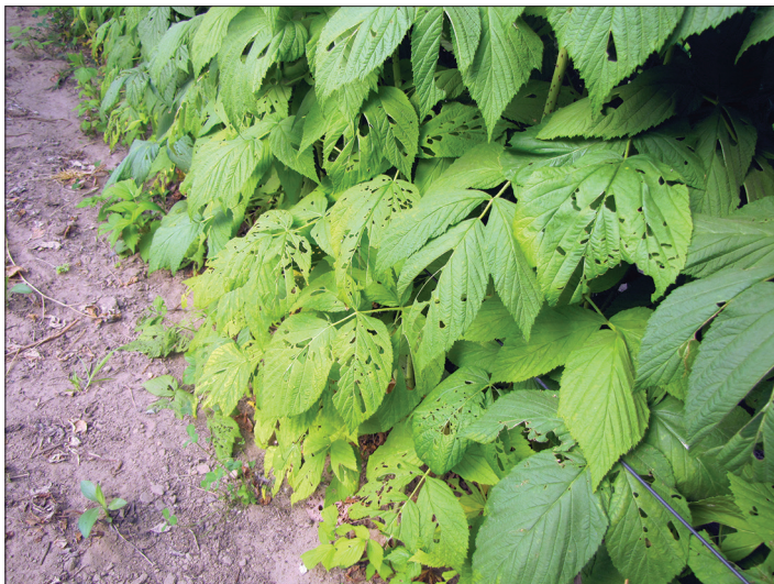
Raspberry sawfly damage.