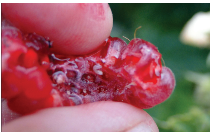
Inside of raspberry showing larvae of spotted wing Drosophila.

Spotted winged Drosophila (SWD) is the most important pest of tunnel and field raspberries. This small vinegar fly infests and contaminates berries. In mid-Michigan, populations are generally low until early August when their activity increases sharply and remains high late into the fall. This outbreak coincides with harvest of primocane-fruiting (fall-fruiting) raspberries. Organic pesticide