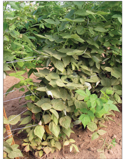
Rafael Isaac, MSU

Less serious raspberry pests encountered during this project include raspberry sawflies ( Monophadnoides geniculatus ), potato leafhoppers ( Empoasca fabae ) and Japanese beetles ( Popillia japonica ). Raspberries are preferred by Japanese beetles. When populations are high, beetles can be picked from small plantings by hand and disposed of in buckets of soapy water. Potato leafhoppers feed on raspberry leaves and cause deformed growth and stunted canes. In our research, damage was severe on the variety Polka, but only minor on the other two cultivars. Sawflies cause some damage to leaves early in the summer, but likely not enough to cause economic losses.