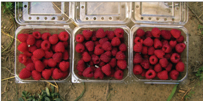
Appearance of the raspberry varieties (L to R) Himbo Top, Joan J and Polka from organic tunnels.

Relative harvest season for various primocane fruiting raspberry varieties in tunnels in southern Michigan. Harvest volume increases with bar darkness.