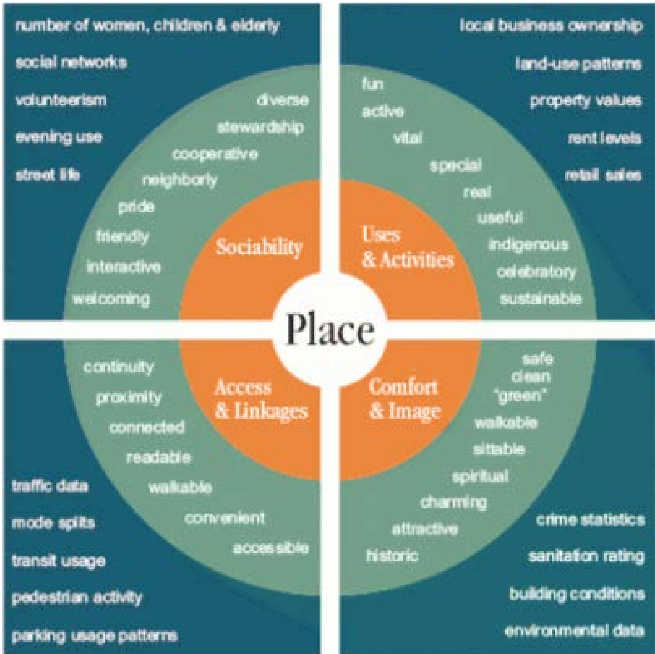
Figure 2: Components of placemaking | Graphic by Glenn Pape of MSU Land Use Institute from a similar graphic by Project for Public Places, New York.

The most important thing about “quality place” is that each community has its own unique characteristics. Each community has its own set of assets and attributes that are genuine for that community. One should build on those unique assets to enhance and build place.