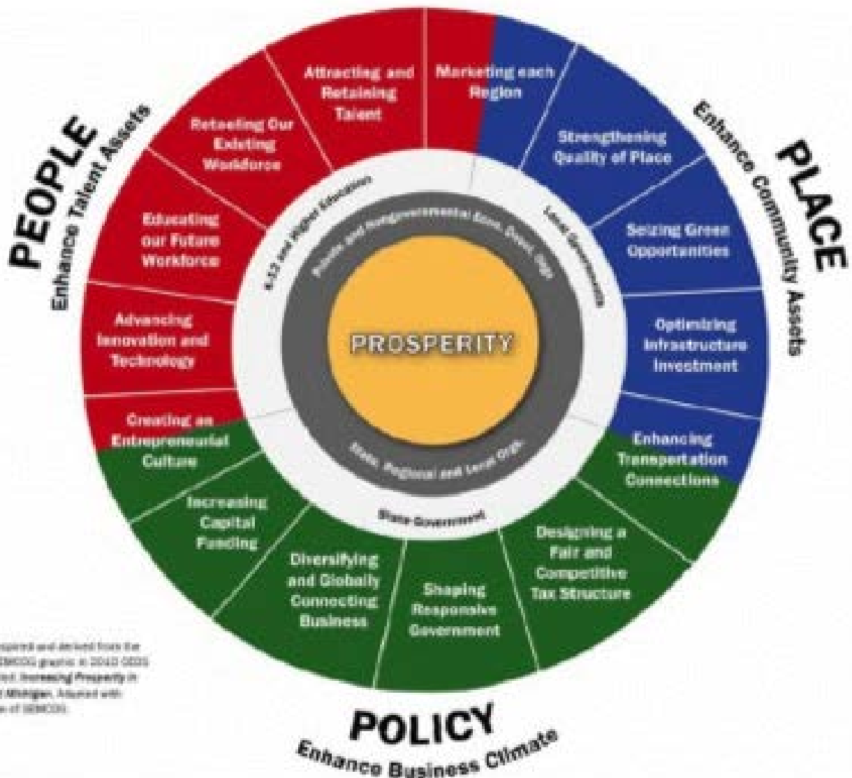
Figure 3 Categories of across-the-board various strategies for Michigan to be competitive in the new economy. | Results of a Land Policy Institute Prosperity Initiative for Michigan