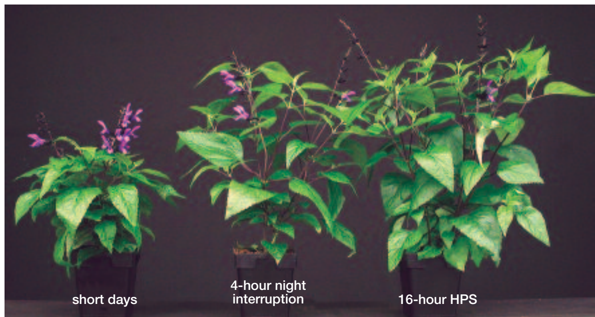
Research plants of Salvia guaranitica 'Black and Blue' under short days, long days and 16-hour HPS lighting.

It is common knowledge that Black and Blue is susceptible to white fly. We suggest you grow and market promptly, and this will greatly