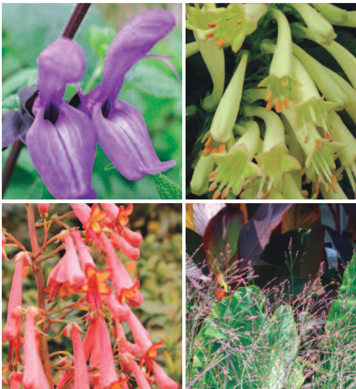
Top, left to right: Salvia 'Black and Blue'; Yellow Phygelis aequalis ; bottom, left to right: Red Phygelis sp.; Panicum virgatum 'Shenandoah'.

reduce the problem. Overgrown floppy plants are not only difficult to treat with chemicals; they are a pain to ship. Overall, it is best to market short plants with flowers. Indeed it is the intensely dark blue flowers that are of ornamental interest. After a recent plant sale, we observed that the only Black and Blue plants remaining were those with no flowers. Photos can never substitute for the real thing.