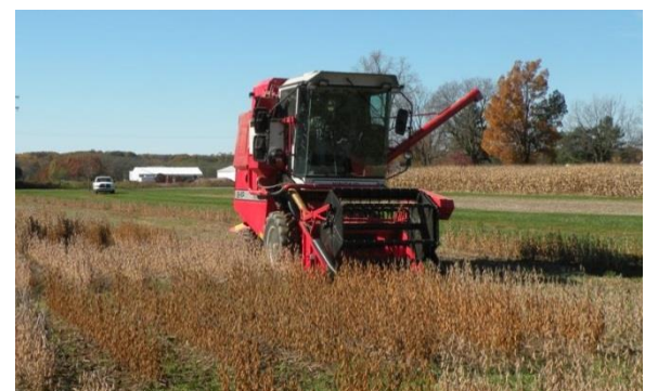
Harvesting soybeans at Kalamazoo site, October 26.