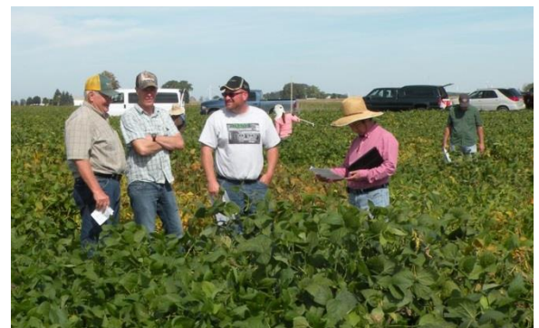
Farmers, breeders and project team review soybean varieties during the Sept. 26, MSU Extension Summer Organic Tour.