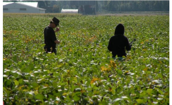
Rating Soybean Varieties for White Mold.