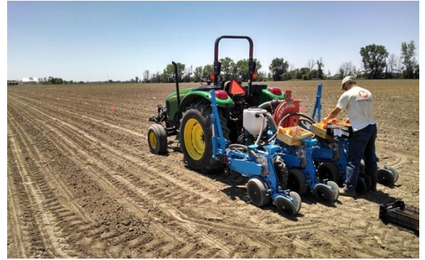
Planting Tuscola Organic Soybean Variety trial.

Growers should note seed size when selecting planting rates. Planting rates should be based on number of seeds per acre and not on pounds per acre. It often benefits growers to select a few good varieties for planting each year. Yield determination and careful field evaluation during the growing season will add to the grower's knowledge of variety performance and allow for better selection.