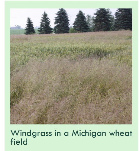
Windgrass in a Michigan wheat field

Common windgrass ( Apera spica-venti L.) is a winter annual grass species that has become more of a weed problem in winter wheat production. In the past the distribution of common windgrass in Michigan has been limited. However, over the last several years this weed has been reported in several counties. Management of this weed can be difficult because the emergence pattern and growth closely coincide with winter wheat, and the availability of selective herbicides is limited.