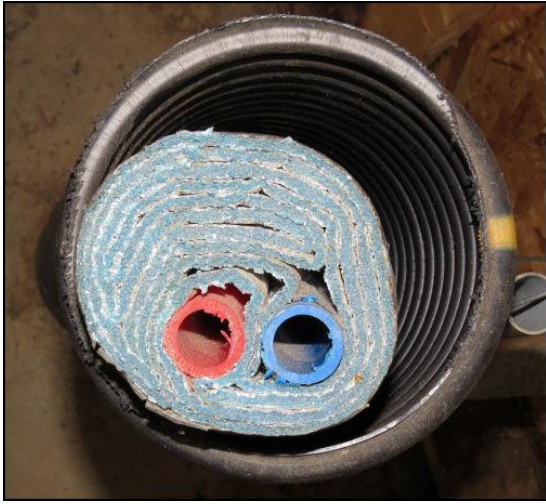
Hot water piping & insulation.