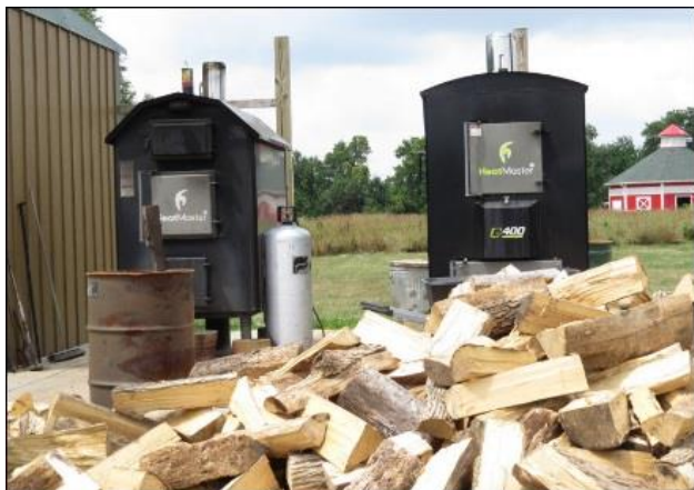
HeatMaster Cordwood Boilers.

Heat and domestic hot water is supplied with a pair of EPA Phase 2 certified HeatMaster G-Series outdoor gasification wood boilers servicing a forced air system.