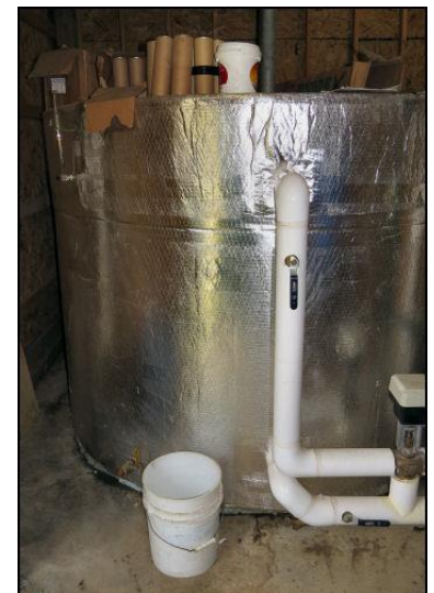
1600-gallon thermal storage tank.

The smaller G200 boiler (200,000 btu) was installed in 2011, then a larger G400 boiler (375,000 btu) in 2015. A 1600-gallon thermal storage tank is housed in a small building separate from Malachi Hall, near to the boilers, which are not in a building.