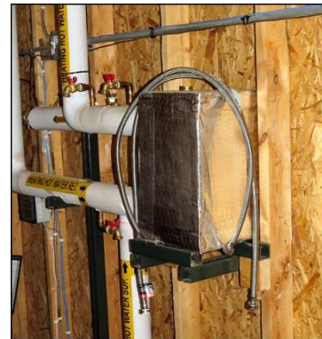
Heat transfer unit.