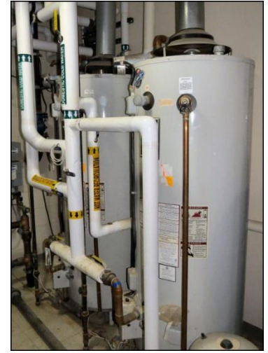
Domestic hot water tanks.

Capital costs were $175,000 with $76,000 in federal funds, a matching $78,600, and in-kind gifts of $17,800. Construction time was about one year.